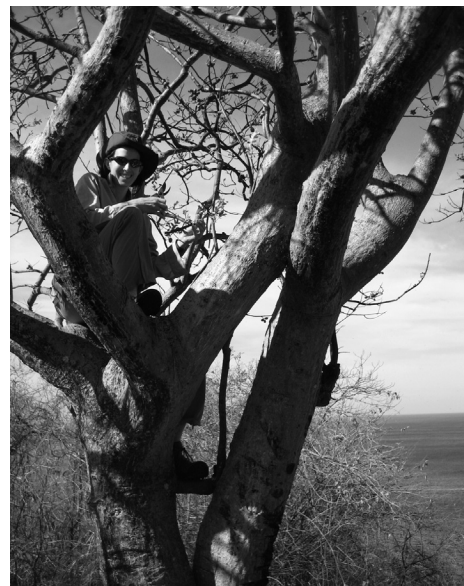
Susan Pell conducting research in Costa Rica.

Information is on the sponsoring department's website. Sponsors are in parentheses. For locations, call (215) 898-5000 or see www.facilities.upenn.edu