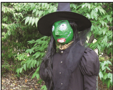
Enjoy the 10th Annual Scarecrow Walk at the Morris Arboretum, October 7-31. See Special Events.