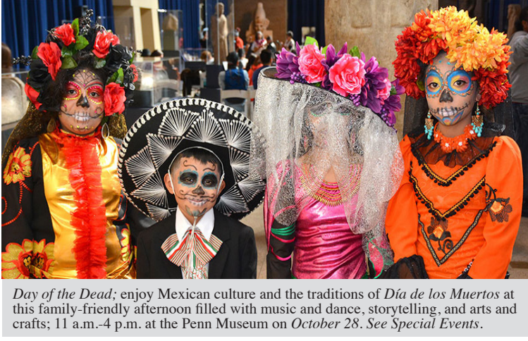
Day of the Dead; enjoy Mexican culture and the traditions of Día de los Muertos at this family-friendly afternoon filled with music and dance, storytelling, and arts and crafts; 11 a.m.-4 p.m. at the Penn Museum on October 28. See Special Events.