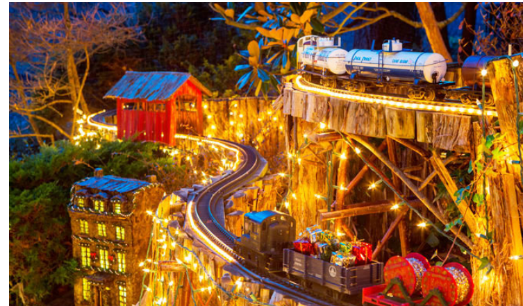
Come see the Morris Arboretum's Holiday Garden Railway dressed in its wintry finest at the grand opening on November 26! Take part in a fun craft for the kids and enjoy the winter garden. The Holiday Garden Railway runs from November 25 through December 31. See Special Events.

Penn Libraries Workshops Including: Canvas Help; JMP: Statistical Discovery Software; LinkedIn; Make your own Prezi; Microsoft PowerPoint; Microsoft Word; Zotero Workshop and more! Register: http://tinyurl.com/objw8z9