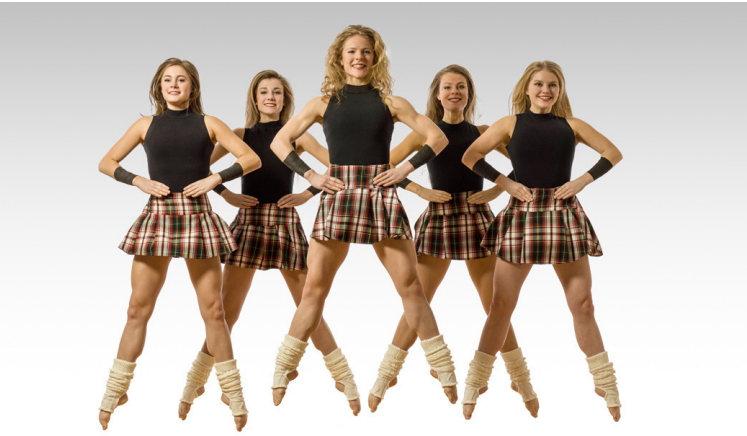
Trinity Irish Dance Company will perform at Annenberg Center’s Zellerbach Theater March 27-28. See Children’s Activities and On Stage.

Wherever this symbol appears, images are available on our website, www.upenn.edu/almanac/at-penn-calendar