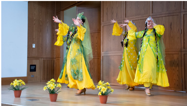
Nowruz, a festival marking the start of spring, will take place Saturday, March 28 at Penn Museum. See Special Events.