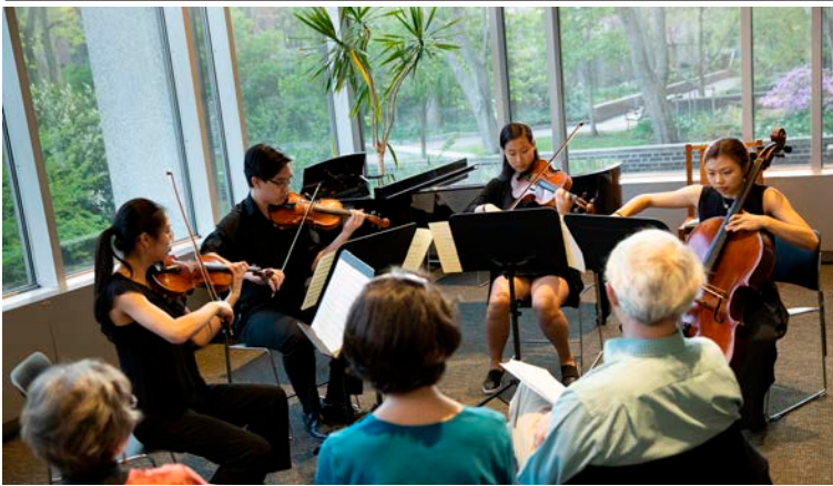
Penn Chamber will perform in Van Pelt Library and Fisher-Bennett Hall's Rose Recital Hall in December. See Music.