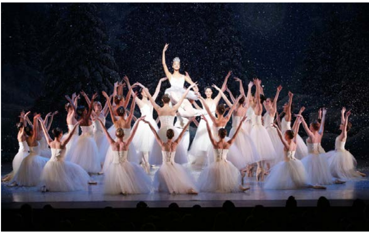
Nutcracker 1776 will be on stage December 6 & 7 in Zellerbach Theatre at Annenberg Center. See On Stage.