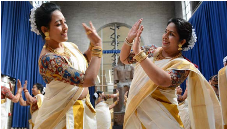
CultureFest!: Celebrations Around the World at Penn Museum on December 7 will include live musical performances, dance and storytelling. See Special Events.

Morris Arboretum: hours, prices: morrisarboretum.org