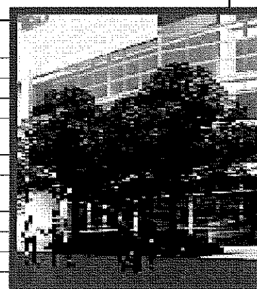
Opening spring 2000