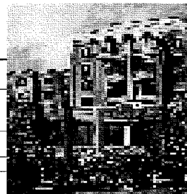
Opening fall 1999