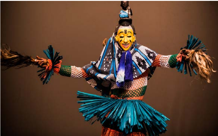
Traditional West African dance and drumming take centerstage at Annenberg Center for the Kulu Mele African Dance & Drum Ensemble November 30. See On Stage.

15 Guided Meditation; 12:30 p.m. Also November 26.