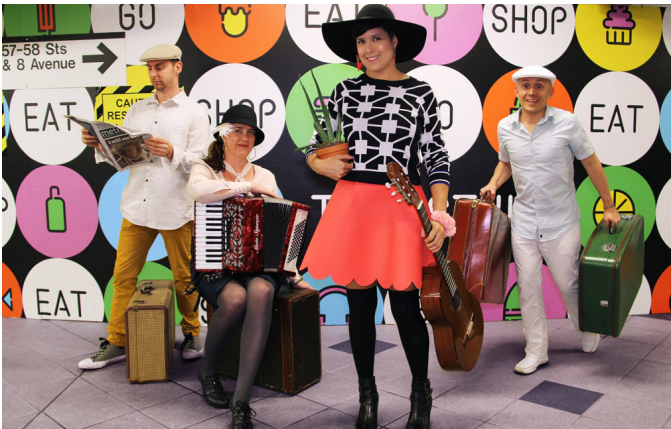
The slapstick duo SMIRK (top) will perform May 2-3 while the band Moona Luna (bottom) will take the stage May 2-4. See Children’s Activities.