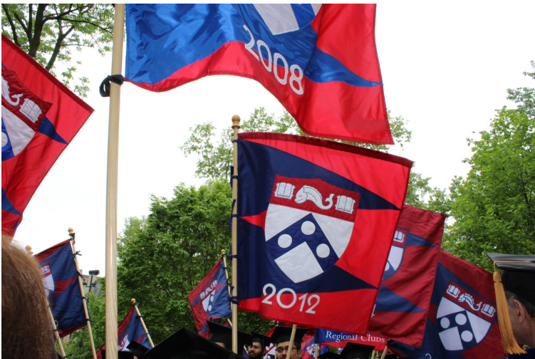
Many generations of alumni will be represented in the Alumni Parade of Classes on Saturday, May 18. See Family Fun.