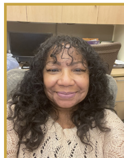
Colleen Winn African-American Resource Center