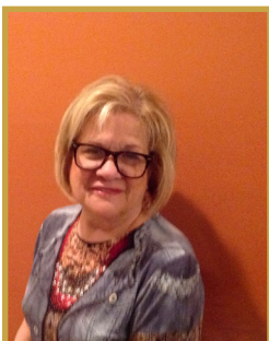
Illene Rubin Penn Libraries