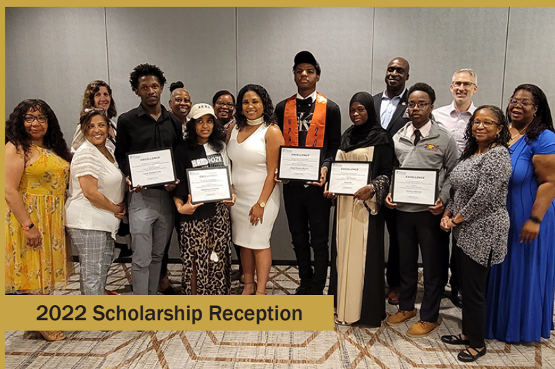
2022 Scholarship Reception