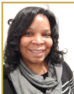
Rorujorona Ferrell Penn Museum