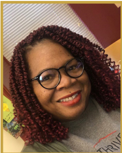
Dr. Valerie D. Allen African-American Resource Center