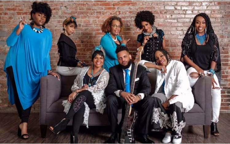
Sweet Honey in the Rock , an internationally renowned a cappella ensemble, will perform at Annenberg Center on September 21. See Music .

Kelly Writers House Activities Fair ; 1-4 p.m.; Class of 1942 Garden, Kelly Writers House.