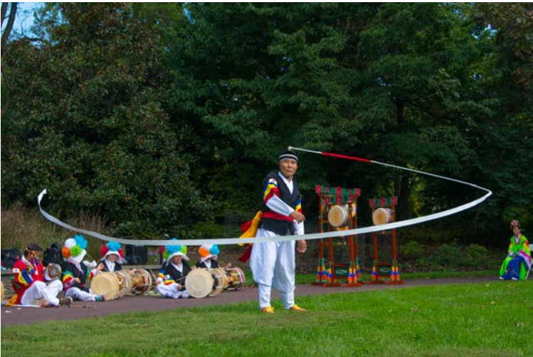
Korean Culture Day celebration will occur at Morris Arboretum on September 28. See Special Events.