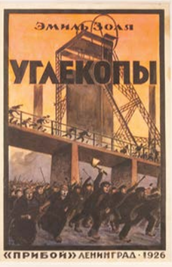
Nikolay Ushin, book cover design for Emil Zola's Germinal (Russia, 1926).

Michelle Lopez: Ballast & Barricades ; employs a fragmented architectural language to critique systems of power and consumption; ICA; opening celebration: 6:30-9 p.m. Through May 10, 2020.