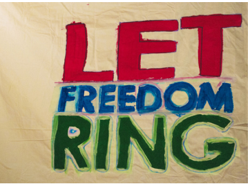
(Above) Banners painted by children during an MLK Day of Service.