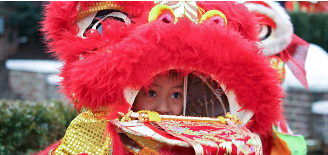
Penn Museum’s Chinese New Year Celebration will be held on January 27. The festive day features traditional Chinese music, contemporary Asian film and Asian-American art, zodiac gallery tours, tangram workshops, tai chi, falun gong and kung fu martial arts demonstrations, calligraphy, family crafts and much more—with the grand finale drums and the roar of the lion dance and parade. Activities are held in the Museum’s Rotunda, which houses one of the finest collections of monumental Chinese art in the country, and throughout the international galleries of the Museum. See Special Events.