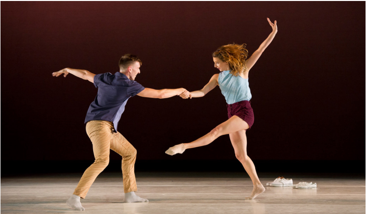
L.A. Dance Project will perform on January 12 and 13 in the Zellerbach Theater at the Annenberg Center. See Children’s Activities and On Stage.