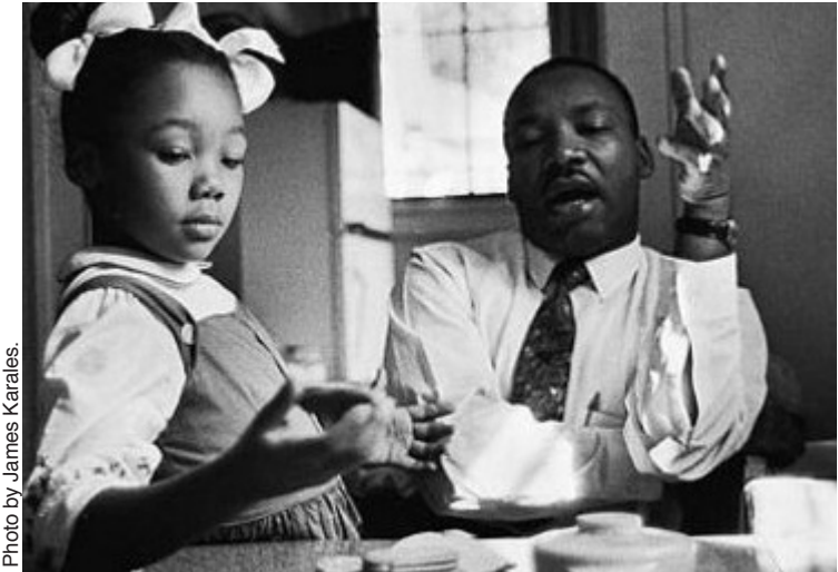
Dr. Martin Luther King, Jr. with his daughter Yolanda King.