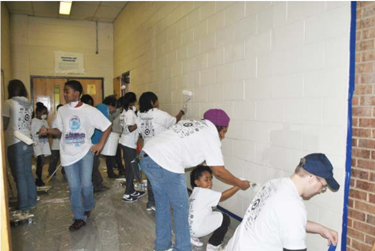
Students at an off-campus location painting as part of a beautification project.