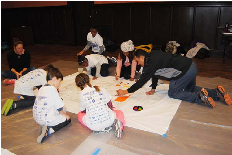
Students taking part in the Children's Banner Painting activity last year. This event will occur again this year on January 21 at Penn.