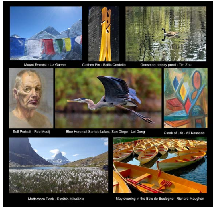
The exhibit Art and Physics: A Different Perspective at Burrison Gallery features art from members of the Department of Radiation Oncology at the Perelman Center for Advanced Medicine. See Exhibits.

Unless otherwise noted, all events are open to the general public as well as to members of the University. For building locations, call (215) 898-5000, or see www.facilities.upenn.edu or the University's website, www.upenn.edu A phone number normally means tickets, reservations or registration required. Almanac carries an Update with additions, changes & cancellations if received by Monday at noon for the following week's issue. University members may send notices for the Update or February AT PENN calendar. Events on this calendar are subject to change. More information can be found on the sponsoring department's website. Sponsors are listed in parentheses.