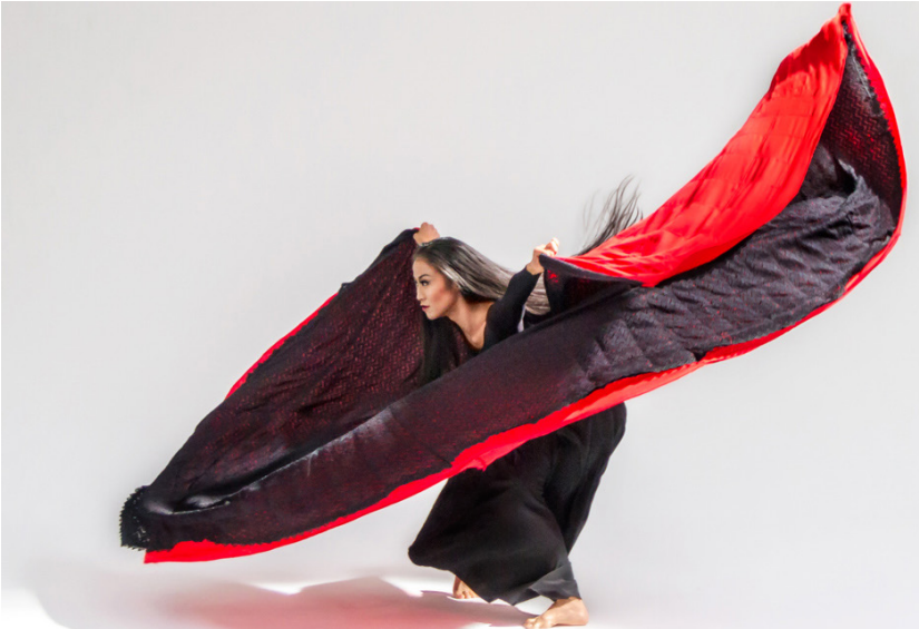
Martha Graham Dance Company will perform at the Annenberg Center. See On Stage.

Human Fibroblast Undergoing Cell Division, Showing Actin (gray), Myosin II (green) and DNA (magenta), and Human Tear Drop (photo below). These images will appear in the 2018 Nikon Small World Exhibition at Wistar. See Exhibits.