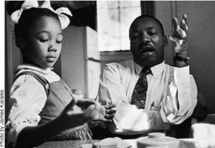
Dr. Martin Luther King, Jr. with his daughter Yolanda King.