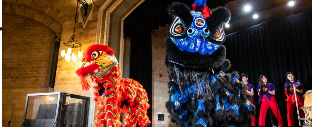
Penn Lions help celebrate the Lunar New Year at the Penn Museum during a day full of festivities. See Special Events.