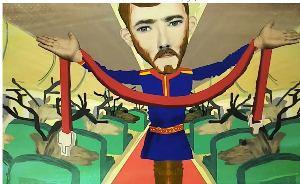
On January 9, the Penn Museum and the Wolf Humanities Center will host the Second Sunday Culture Film , featuring short films by Sámi people.

6 Master of Science in Applied Geosciences Virtual Café ; noon. ☞