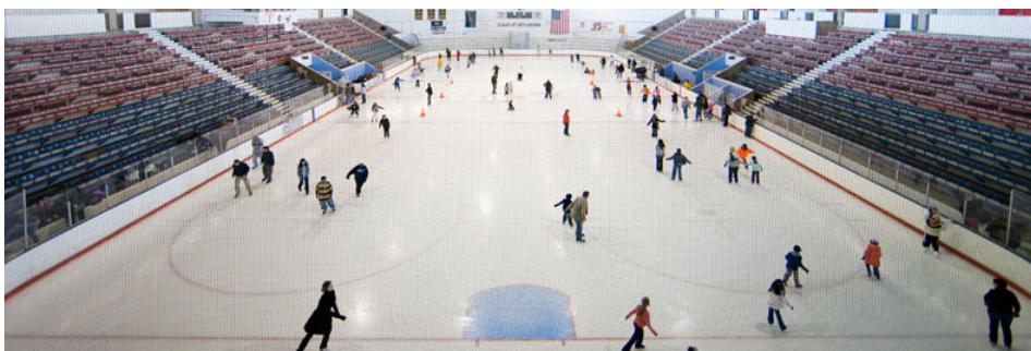
Winterfest returns to Penn Ice Rink on January 21. See Special Events .