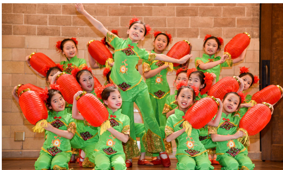
CultureFest! Lunar New Year features a day of fun and family-friendly activities at the Penn Museum. See Special Events.

23 Reading/Writing/Literacy MS Ed Information Session ; 6:30 p.m.