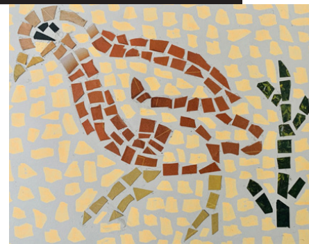
Penn Museum's At Home Anthro Live: Mosaic Making virtual event will take place on December 15. See Children's Activities.