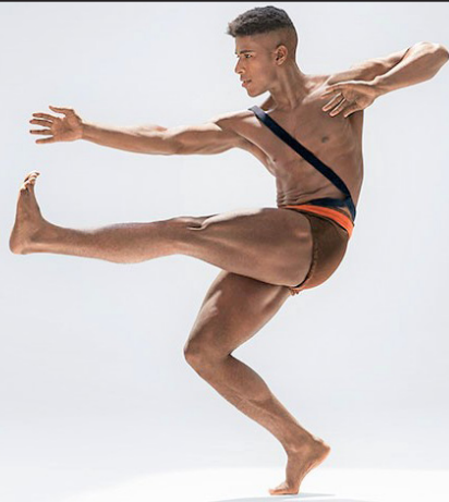
Livestream Martha Graham Dance Company through Annenberg Center on December 10. See On Stage.