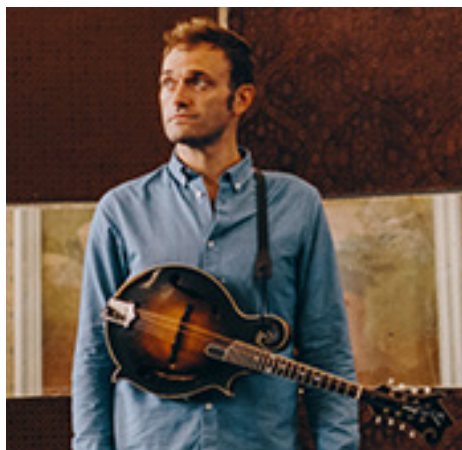
Jazz vocalist Cécile McLorin Salvant (left) and mandolin player Chris Thile (right) are among the musical performers appearing at Penn Arts Live in December.