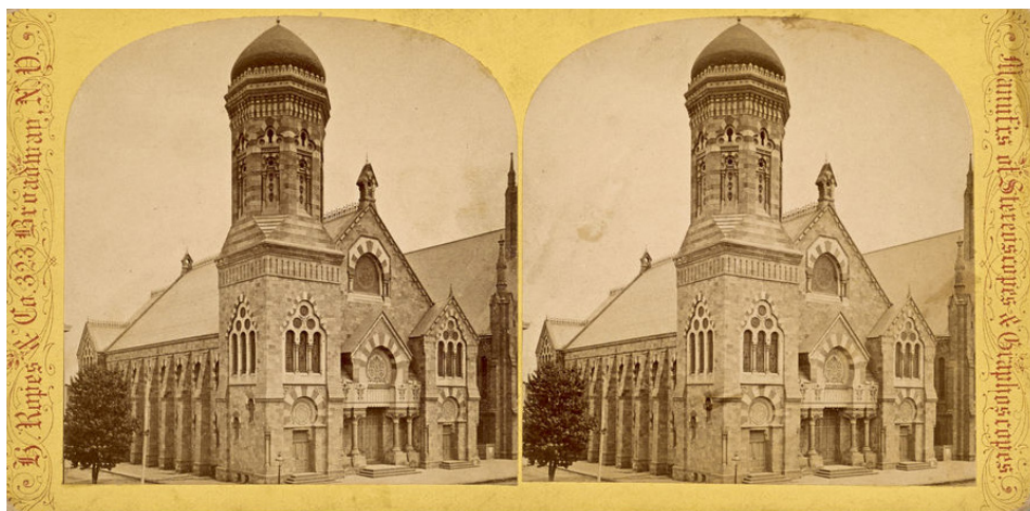
Congregation Mikveh Israel in Philadelphia in 1875. On December 8, a panel of speakers will discuss the role of community in American Jewish life.

9 Writers House Salon ; 7:30 p.m.; Zoom webinar.