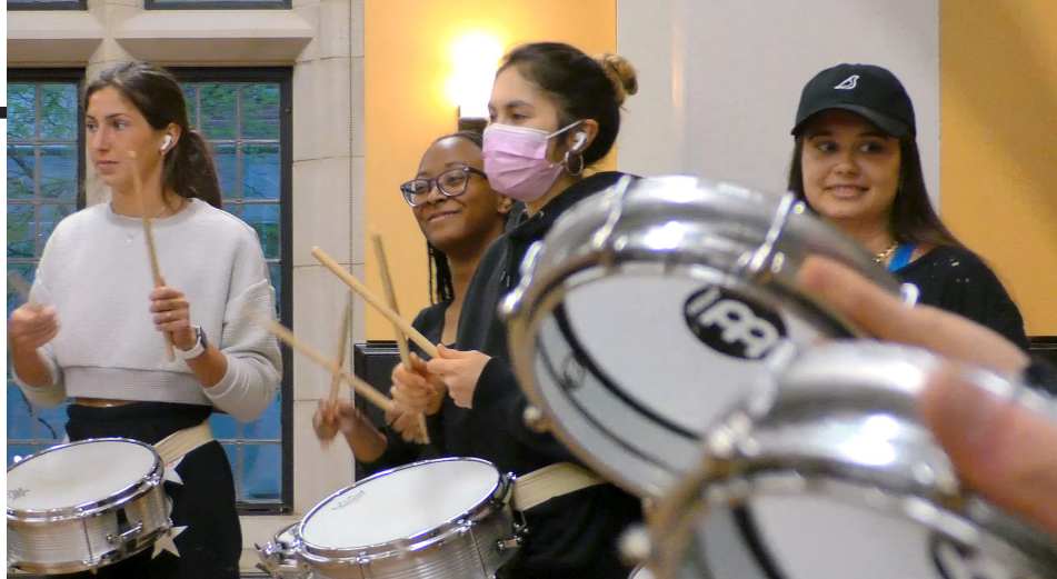
Penn Samba (above) is one of several music ensembles of the School of Arts and Sciences' music department who will perform their fall concerts in December, representing a variety of styles, genres, and national origins. See Music.

13 Bachelor of Applied Arts and Sciences Virtual Information Session ; noon.