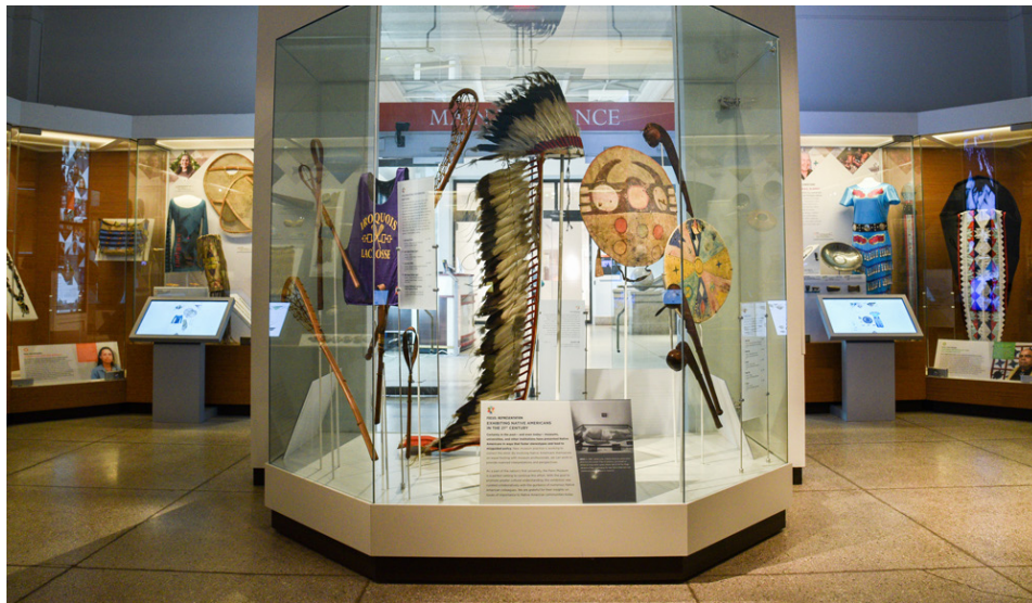
Children can explore artifacts from Indigenous cultures during the Penn Museum's Global Voyagers series on November 2. See Children's Activities.