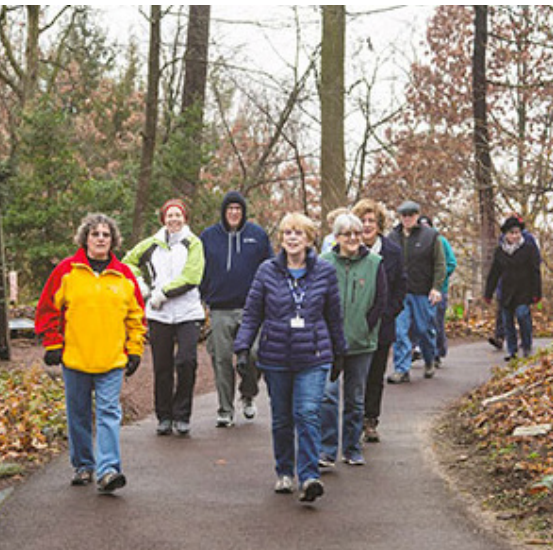
Wellness Walks at the Morris Arboretum. See Fitness & Learning.