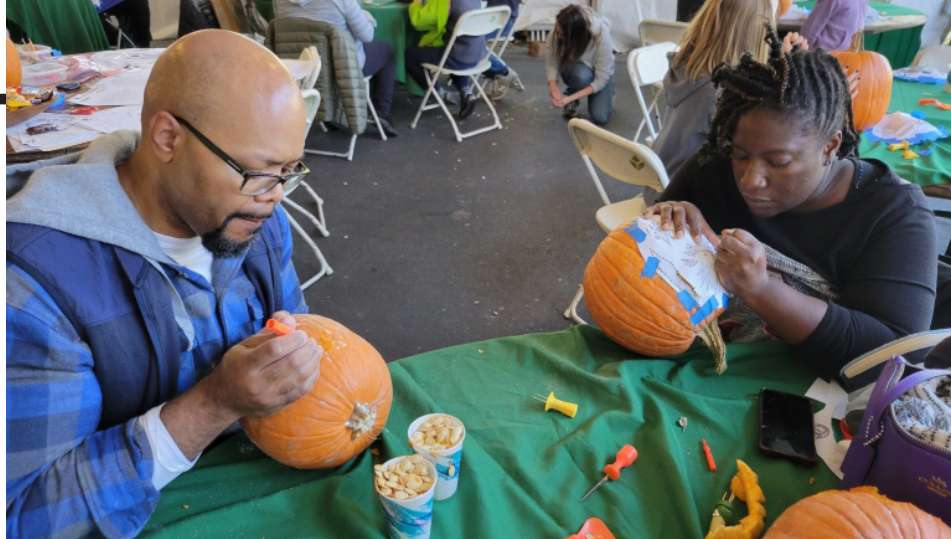
The Morris Arboretum will host a variety of child-friendly events in October, including a pumpkin carving session on October 28. See Children's Activities.

U-2 Spy Planes & Aerial Archaeology ; offers a look at the United States military's top-secret aerial reconnaissance during the 1950s and 1960s, the key geographic features and lost landscapes they captured accidentally, and the