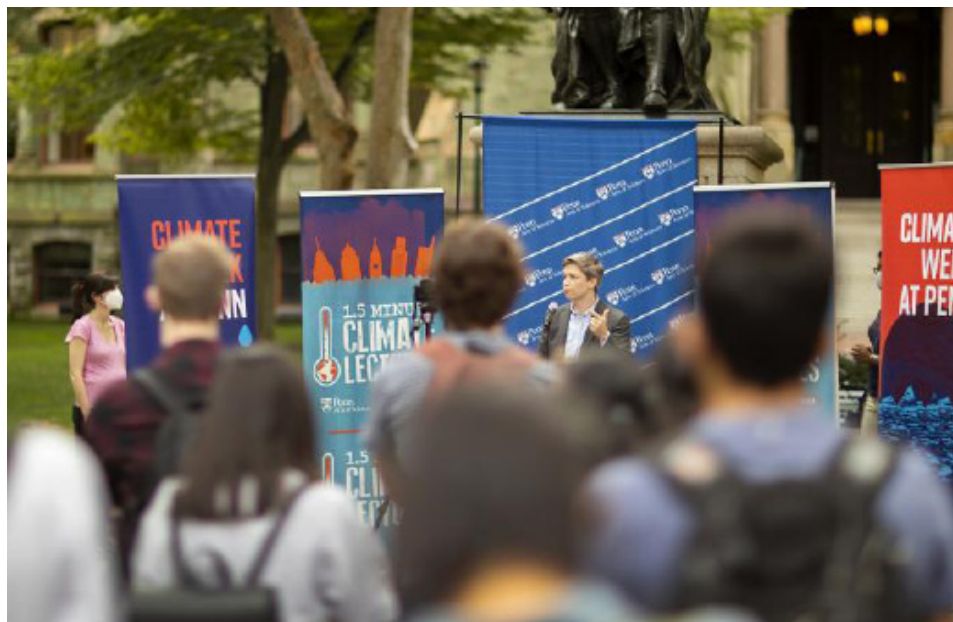
Climate Week at Penn, a week-long series of talks, conferences, and other events, returns to campus from October 14-18. See Special Events.

Witte-Sakamoto Family Medal in City and Regional Planning ; panel of representatives of the City of Charlotte, North Carolina; 6 p.m.; Kleinman Energy Forum, Fisher Fine Arts Library; register: https://tinyurl.com/witte-sakamoto-oct-24 (City & Regional Planning).