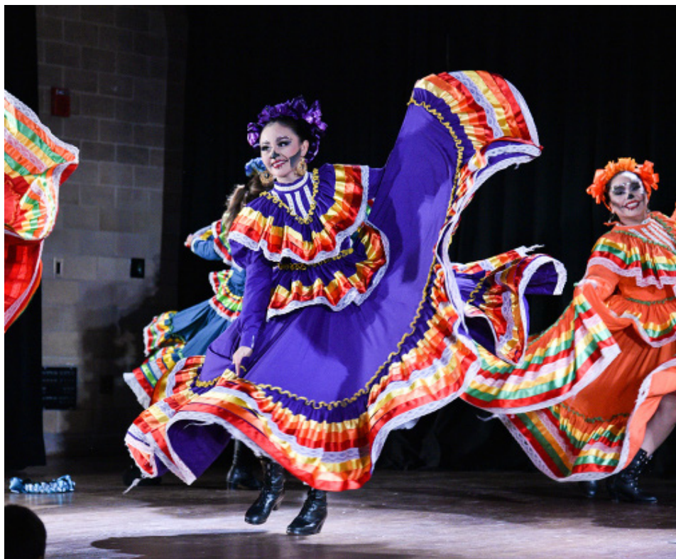
On October 26, CultureFest! at the Penn Museum will celebrate Mexican Holiday Dia de los Muertos with a day of activities, museum exploration, and performances. See Special Events.