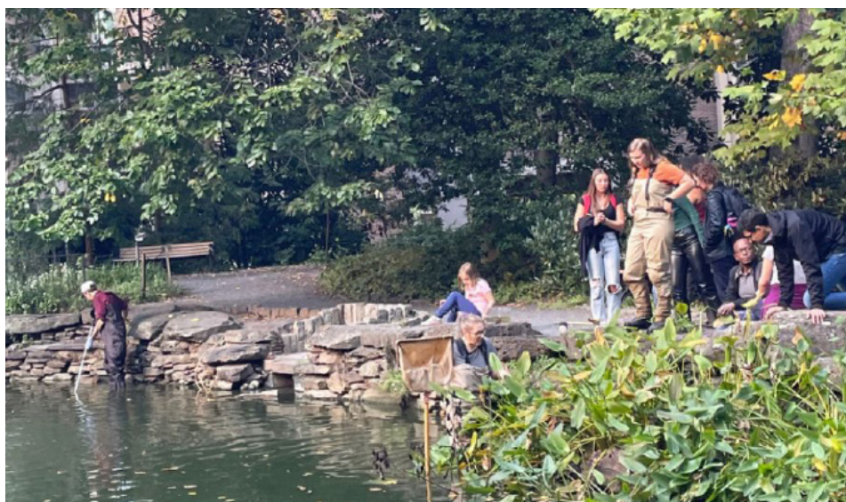
Penn Vet's Fall 2024 Bioblitz takes place on October 16 to teach about the variety of plant and animal life that frequent Penn's pastoral Biopond in Kaskey Park. See Fitness & Learning.