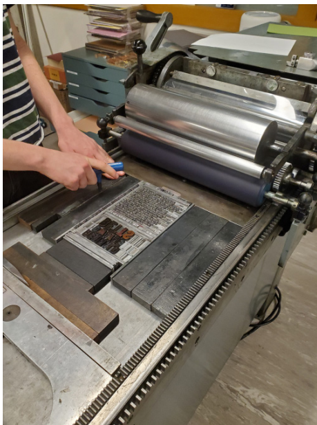
Penn's Common Press in the Fisher Fine Arts Library offers a unique venue for members of the Penn community to learn about manual typesetting. The press will host several workshops in October to allow the public to learn about printing. See Fitness & Learning.

29 Dehydrating the Harvest ; Dorothy Bauer, Weavers Way Co-Op; 6 p.m.; tickets: $45/members, $40/general.