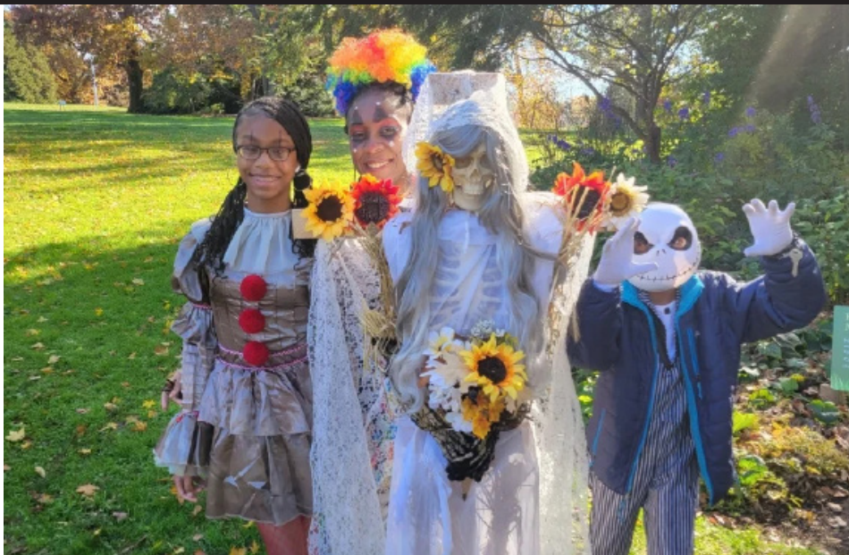
The Morris Arboretum & Gardens offers Halloween-themed activities this October, including a costume dance party on October 22. See Children's Activities.

that offers free euthanasia services to all Japanese citizens 75 and older to deal with its rapidly aging population; 6:30 p.m.; location TBA (Center for East Asian Studies).