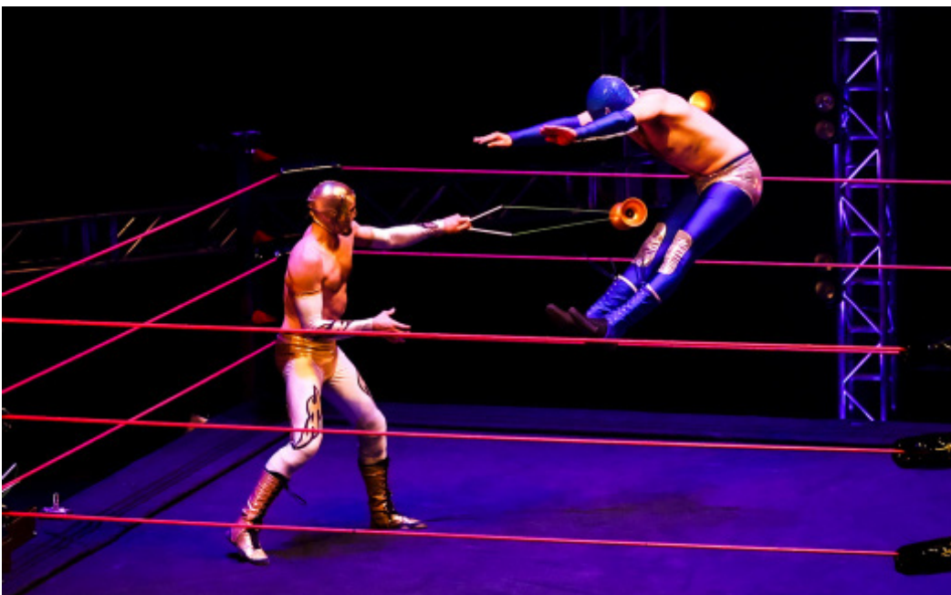
On October 25, Penn Live Arts presents FLIP Fabrique , a Canadian cirque troupe, for the Philadelphia premiere of a new piece of work that amplifies the theatrical and graceful nature of wrestling. See On Stage .