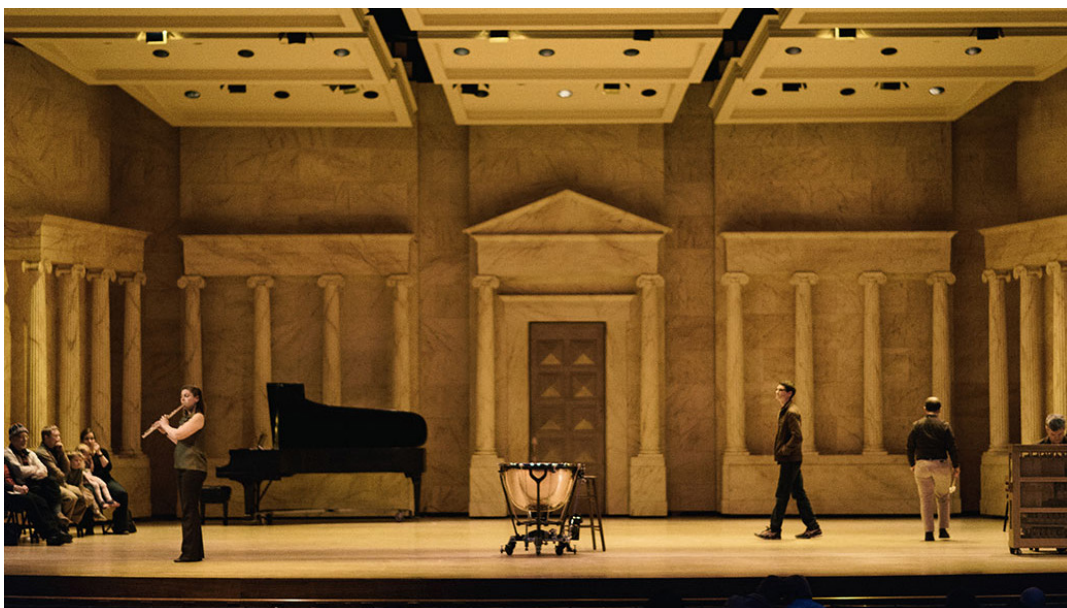
The new-music ensemble Alarm Will Sound will premiere an experimental piece based on the sounds of bird-song at Penn Live Arts (formerly the Annenberg Center for the Performing Arts) on September 25. See Music.