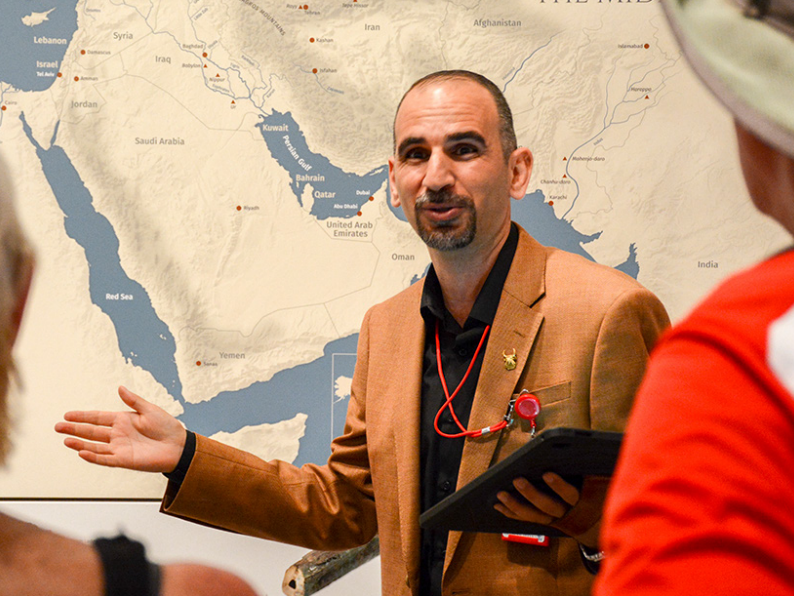
Penn Museum Global Guide tours offer a unique chance to view an exhibit, led by a guide who grew up in the region. See Exhibits.

deep-dig-sept-2021 (Penn Museum). Also September 16, 23, 30. ☞