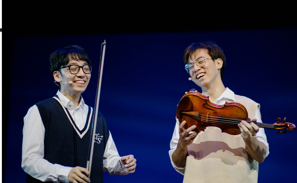
Popular Australian duo TwoSet Violin will bring their unique combination of comedy and classical music to the Annenberg Center on September 14. See Music.

1 Understanding Greenland Outlet Glacier Calving Using Big Data ; Ginny Catania, Uni-