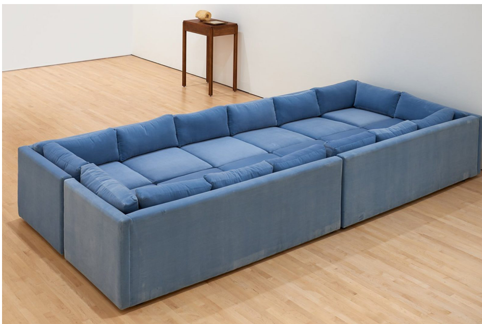
On September 8, the Institute of Contemporary Art will hold an opening celebration event for its two fall 2023 exhibits, including Moveables , which reimagines the potential of everyday objects. See Exhibits.