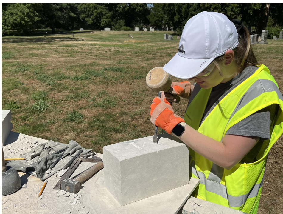
The Weitzman School of Design's department of historic preservation will host a stone carving workshop on September 8 at the Woodlands Cemetery. The workshop will teach the use of several different tools and techniques. See Fitness & Learning.