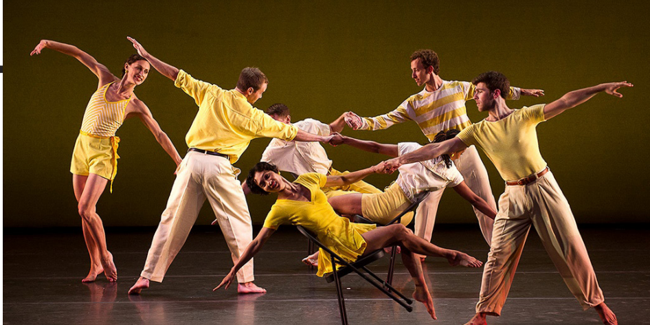
Penn Live Arts presents Mark Morris Dance Group: Dances to American Music at the Annenberg Center on September 26 and 27. See On Stage.

health center through a night of networking with local community health professionals; 4:30-7:30 p.m.; lobby, Fagin Hall; register: https://tinyurl.com/nursing-hccd-sept-24 (Penn Nursing).