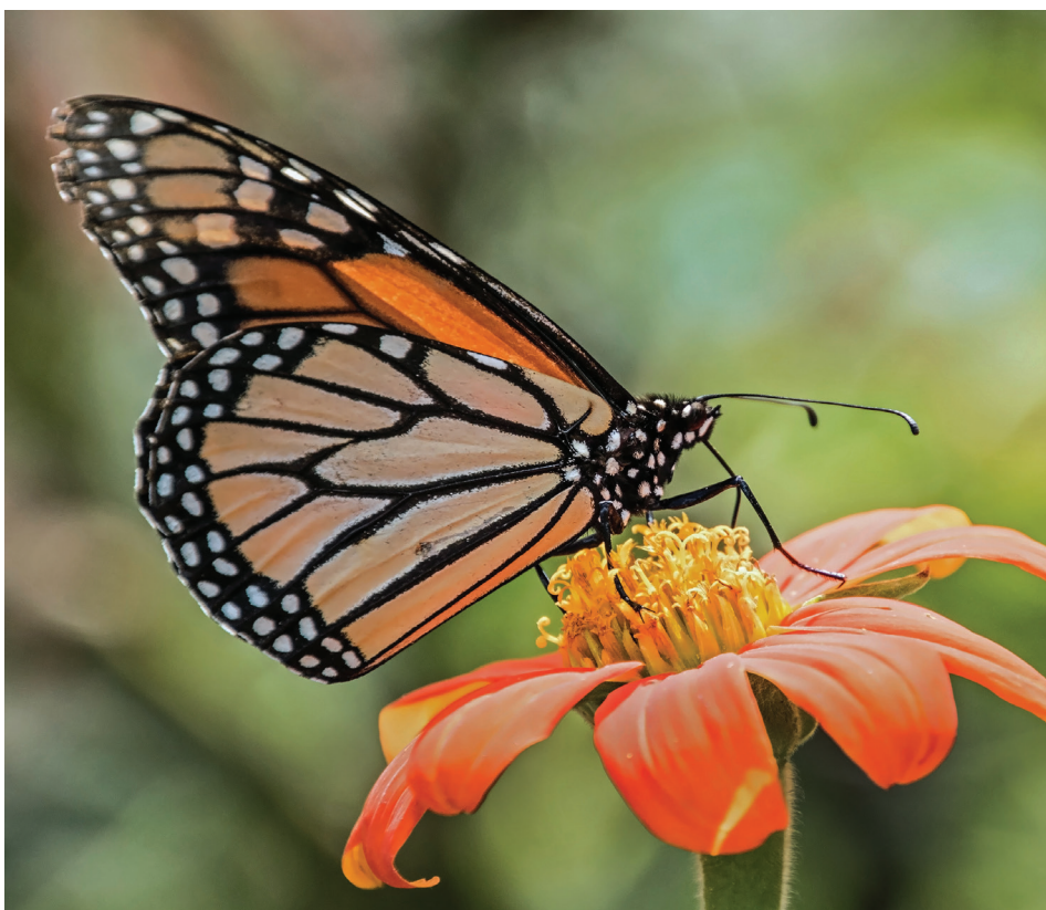
This summer's exhibition at the Morris Arboretum & Gardens examines bees, bugs, flowers, and other elements of the pollination process. See Exhibits.

Accommodations for All: Strategies for Asking for Support at Work ; noon.