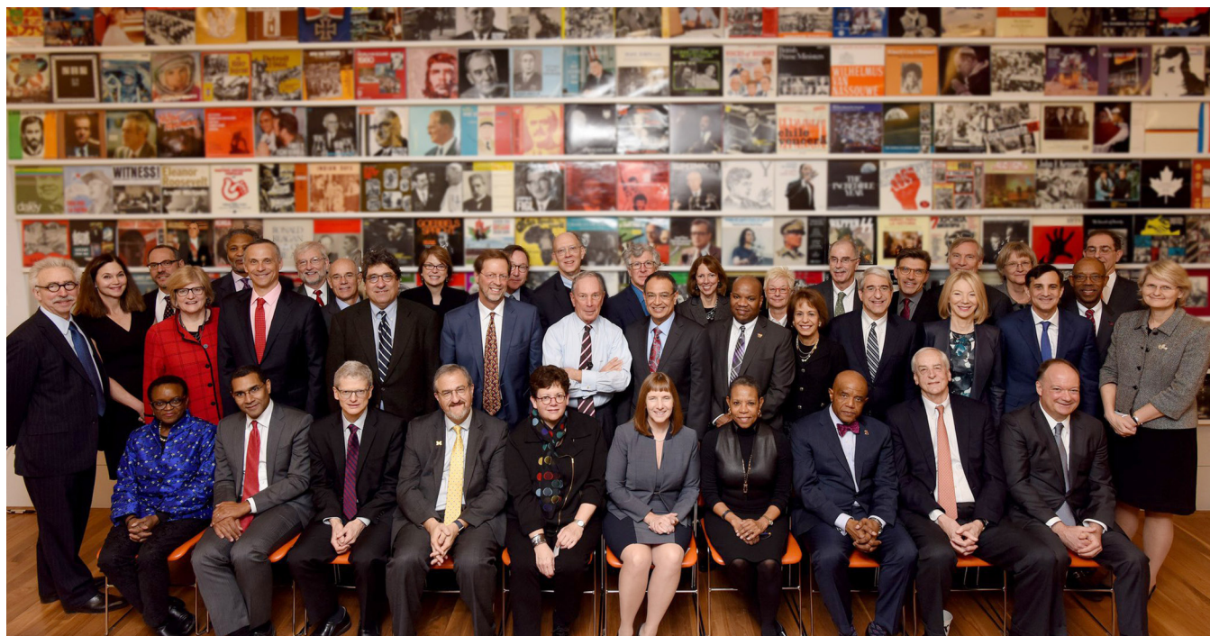
Penn President Amy Gutmann (second row, third from right) joined Michael Bloomberg of Bloomberg Philanthropies (center) and a consortium of peer university and college presidents representing institutions that are American Talent Initiative members.