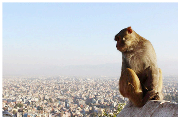
View this image and all the winning photos on the Penn IUR website, https://goo.gl/zRS54I

The winner and runners up were announced at the Global Shifts: Urbanization, Migration, and Demography symposium, held last month at the Perry World House (Almanac April 25, 2017). The contest was judged by the symposium's panel of experts, including PWH Visiting Fellows, who looked for compelling images that emphasize the relationships between urbanization, migration and marginalization.