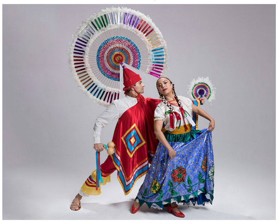
Penn Live Arts presents the Philadelphia Children's Festival at the Annenberg Performing Arts Center May 5-7 featuring concerts, performances, and magic shows. See Children's Activities.

ALMANAC April 30, 2024 www.upenn.edu/almanac 9