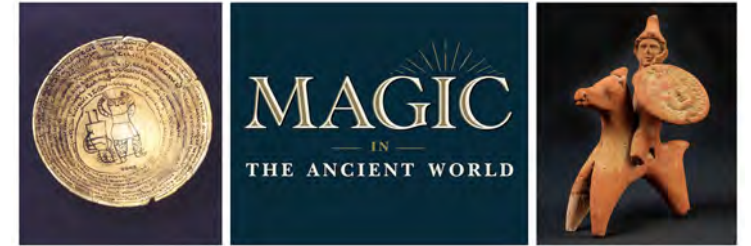
Protective amulets, incantation bowls, curse tablets, powerful rings, magical stones and anatomical votives—these objects and more are featured in Magic in the Ancient World at the Penn Museum on display now through April 30, 2017. See Exhibits.

The Netter Center for Community Partnerships Presents: Perspectives from Alumni on University-Community Engagement ; the many aspects and lasting