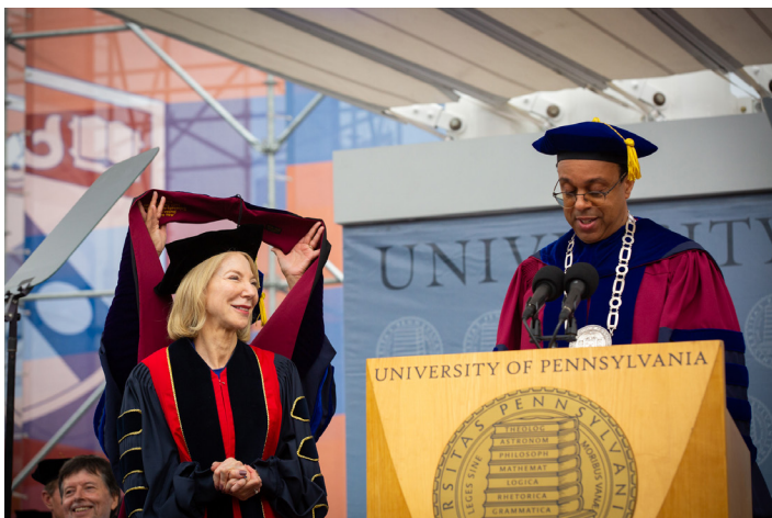
Penn President emerita Amy Gutmann received an honorary Doctor of Laws degree.