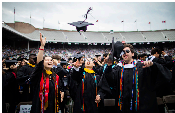
A short rain shower did not dampen the graduates' enthusiasm.