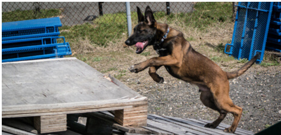
A sample of the training at the Penn Working Dog Center. A tour is available on April 7.

13 Build a Centerpiece With Fresh Spring Flowers ; Cheryl Wilks, Flowers on Location; 11 a.m.-1:30 p.m. Also April 16, 11 a.m.-1:30 p.m.