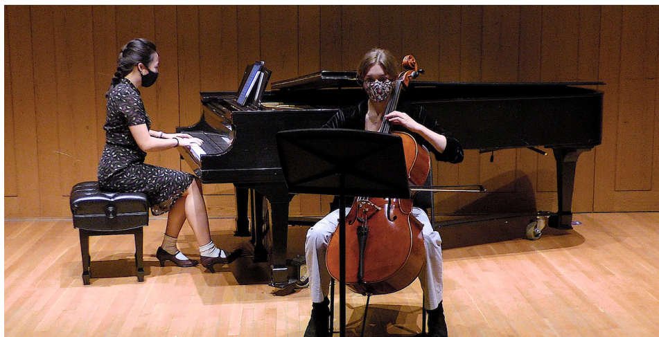
Penn Chamber (above), which has two performances on April 22, is one of several of Penn's music department ensembles that will perform recitals in the month of April.