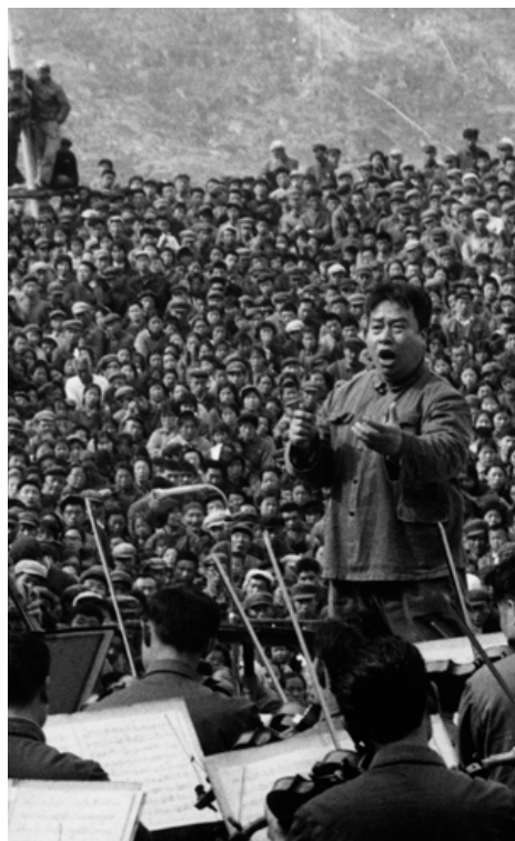
Li Delun (left), a composer and multi-instrumentalist who is said to have brought western classical music to the People’s Republic of China, will be honored during a Penn Libraries conference on April 2. A photo of the isolated mining town (right) that is the subject of the film, Song of Salt . A preview of the film will be hosted by the department of cinema and media studies on April 19.

21 Marathon Reading: Kafka on the Shore ; 9 a.m. until end of book. 🎧