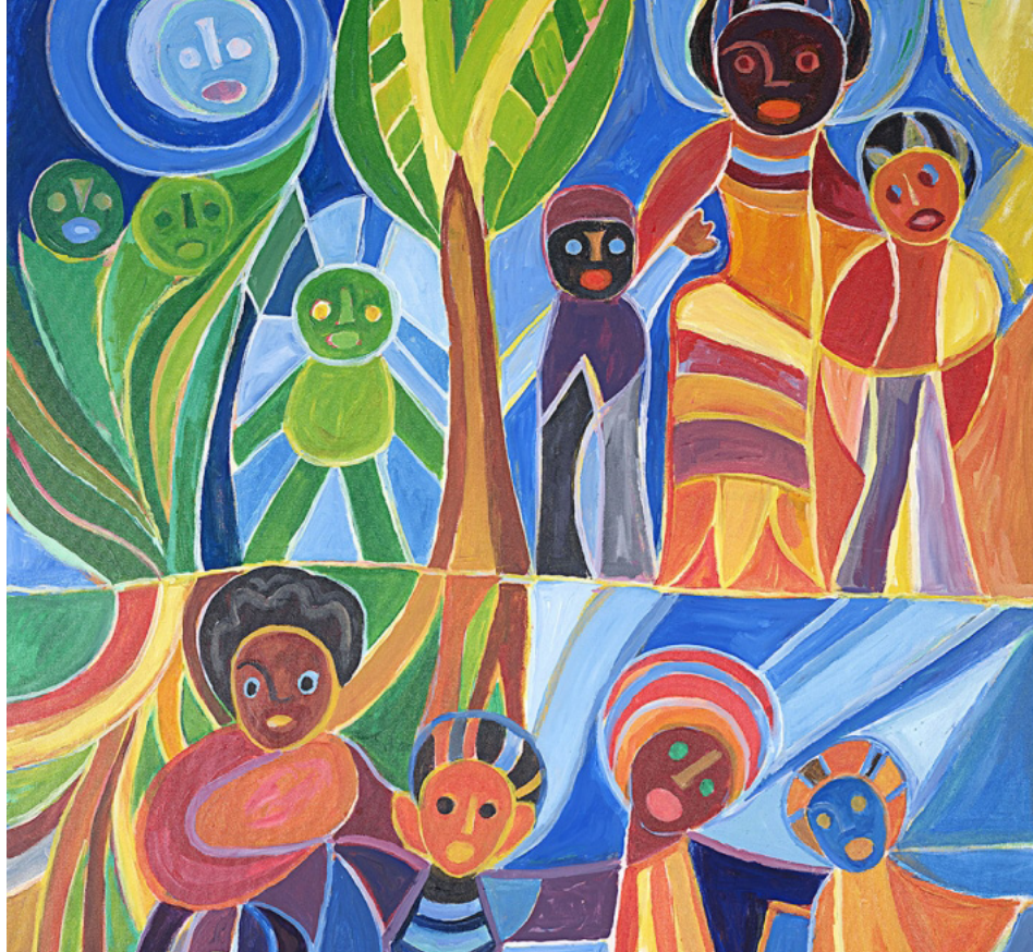
On April 6, an exhibit opens at the Goldstein Gallery in the Fisher Fine Arts Library celebrating the work of children's illustrator Ashley Bryan. See Exhibits and Conferences.

How To Make Yourself Indispensable ; 12:30 p.m.