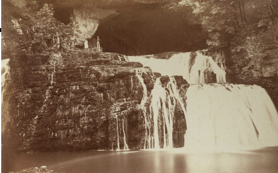
The Arthur Ross Gallery will host an Art Reset on April 7, a leisurely exploration of artworks in its collection. See Fitness & Learning.

MSHP'12; Harvey & Irwin Kroiz Gallery, Fisher Fine Arts Library. Through June 17.