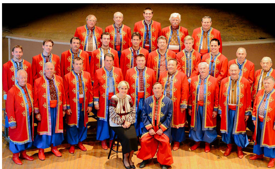
On March 3, Penn Live Arts will host Ukrainian Community Day, which will feature performances by Ukrainian and Ukrainian American artists and family-friendly activities. See Special Events.

Men's Tennis vs. Wagner ; 4 p.m.; Hamlin/Hecht Tennis Centers.