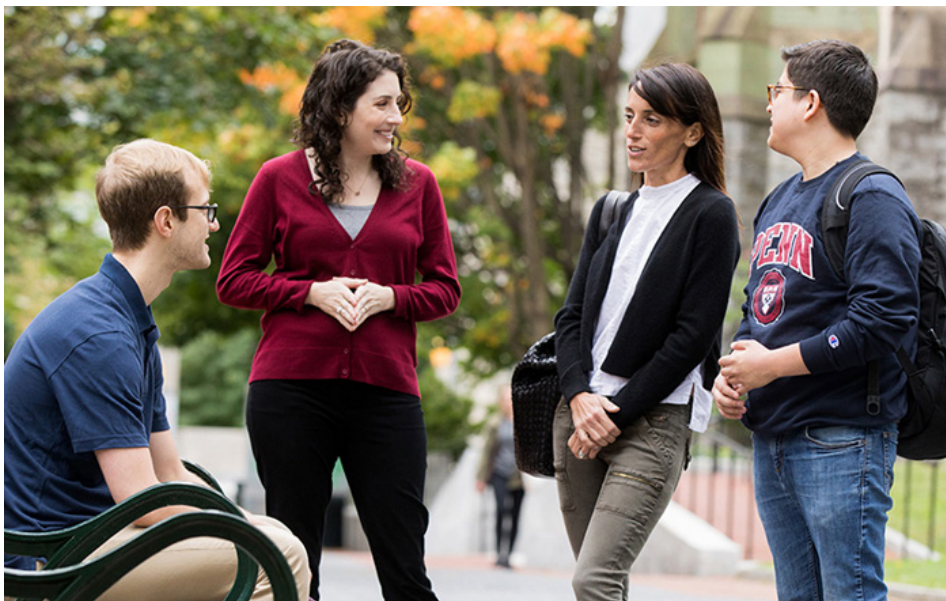
The College of Liberal & Professional Studies will hold several information sessions in March about course programs available to ambitious students of all ages. See Fitness & Learning.