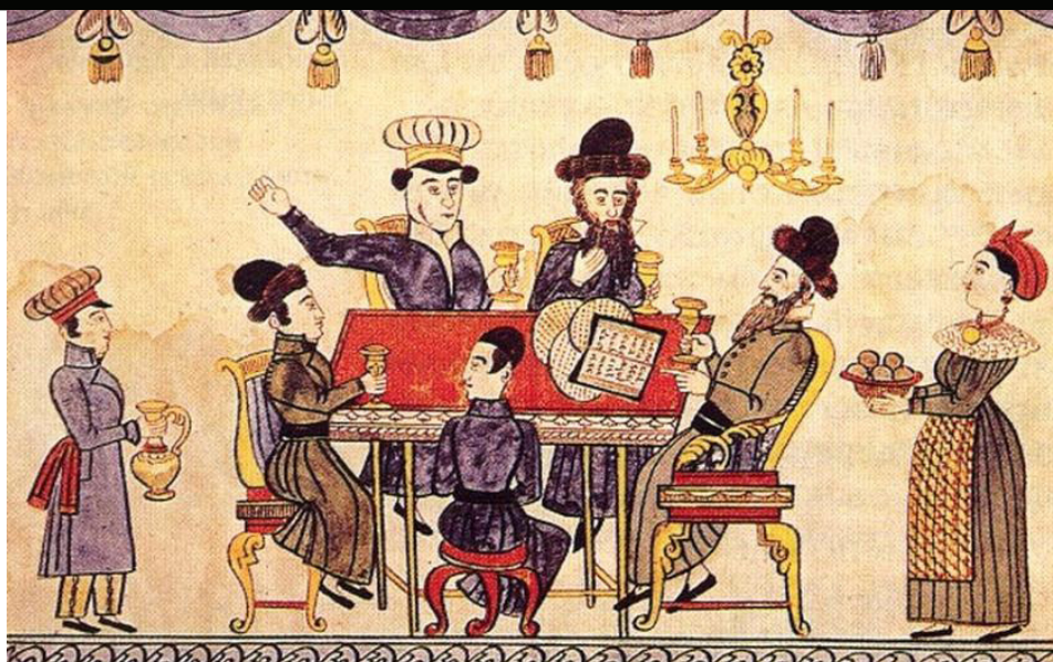
Beginning on March 19, the Katz Center for Advanced Judaic Studies will offer a mini course on the history of the singing of the Haggadah, a Passover tradition. See Fitness & Learning.