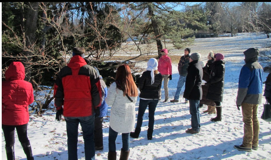
Every weekend, the Morris Arboretum & Gardens hosts Winter Wellness Walks that allow guests to take a brisk and scenic outdoor tour of the arboretum. See Fitness & Learning .

26 Baseball vs. Delaware ; 3 p.m.; Meiklejohn Stadium.