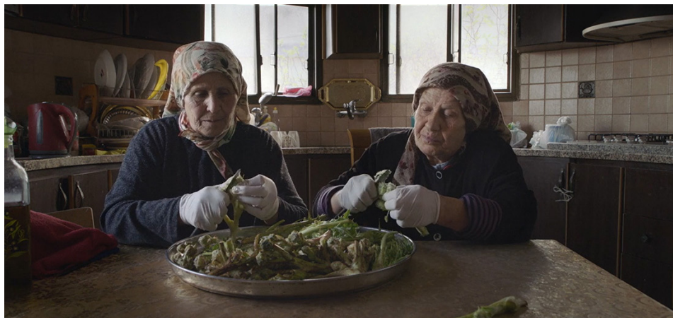
On March 10, the Penn Museum will screen the movie Foragers , which spotlights the Palestinian tradition of foraging wild za'atar and 'akkoub amidst prohibitive law. See Films.

Various locations. Info: https://clals.sas.upenn.edu/events .