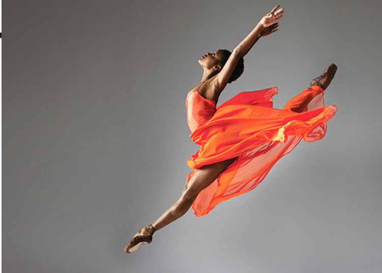
Dance Theatre of Harlem performs at Annenberg Center. See On Stage.