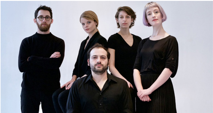
TAK Ensemble (above) will perform Penn Sound Collective works. See Music.