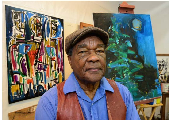
The lecture An Art Journey with David C. Driskell will be held March 21. See Talks.