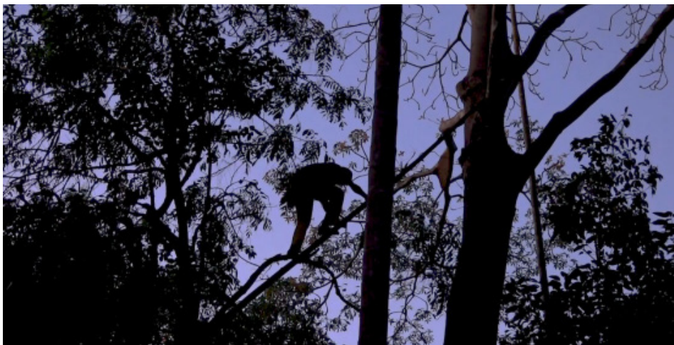
Wild Honey: Caring for Bees in a Divided Land, which explores the island of Timor, split in two by a colonial border, will be shown virtually by the Penn Museum on March 14. See Films.