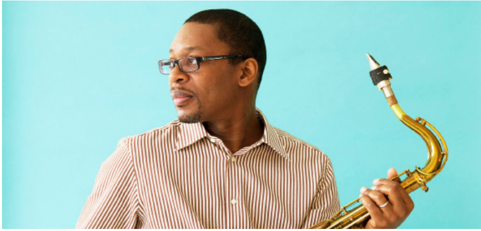
Penn Live Arts brings renowned jazz saxophonist Ravi Coltrane to the Annenberg Center on March 26. See Music.