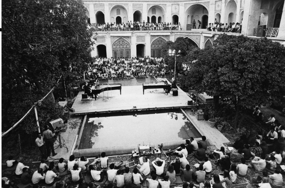
On February 3, the music department presents an ode to the Shiraz Arts Festival, an annual festival held in Iran between 1967 and 1977 that helped meld eastern and western musical traditions. See Music.