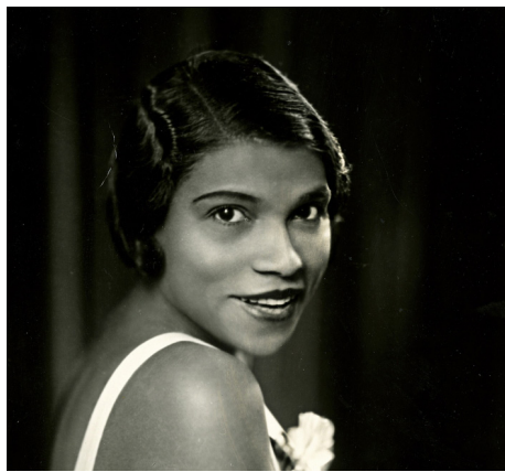
Celebrate Black History Month at the Penn Libraries with a pop-up exhibit celebrating Marian Anderson (left) on her birthday, February 27, and Douglass Day, a celebration of 19 th -century Black achievement honoring Frederick Douglass (right). See Exhibits and Fitness & Learning.

21 Master of Science in Applied Geosciences Virtual Information Session ; noon.