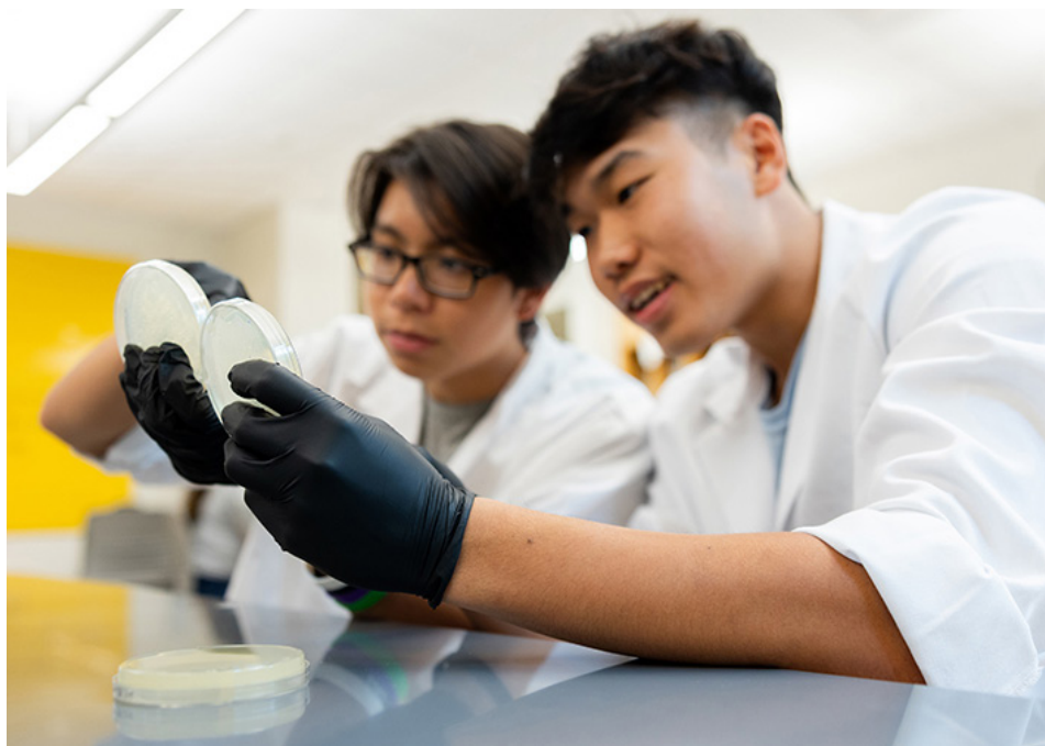
The School of Arts & Sciences' Summer High School Programs allows motivated students to explore subjects ranging from chemistry, biology, and coding to social justice and global media.

Innovation and Startup Culture. Session 1: June 30–July 12. Session 2: July 14–26. Set on Wharton's San Francisco campus, Innovation and Startup Culture provides a whirlwind introduction to the world of new venture creation. Throughout the intensive two-week summer program, students will learn the strategies successful entrepreneurs