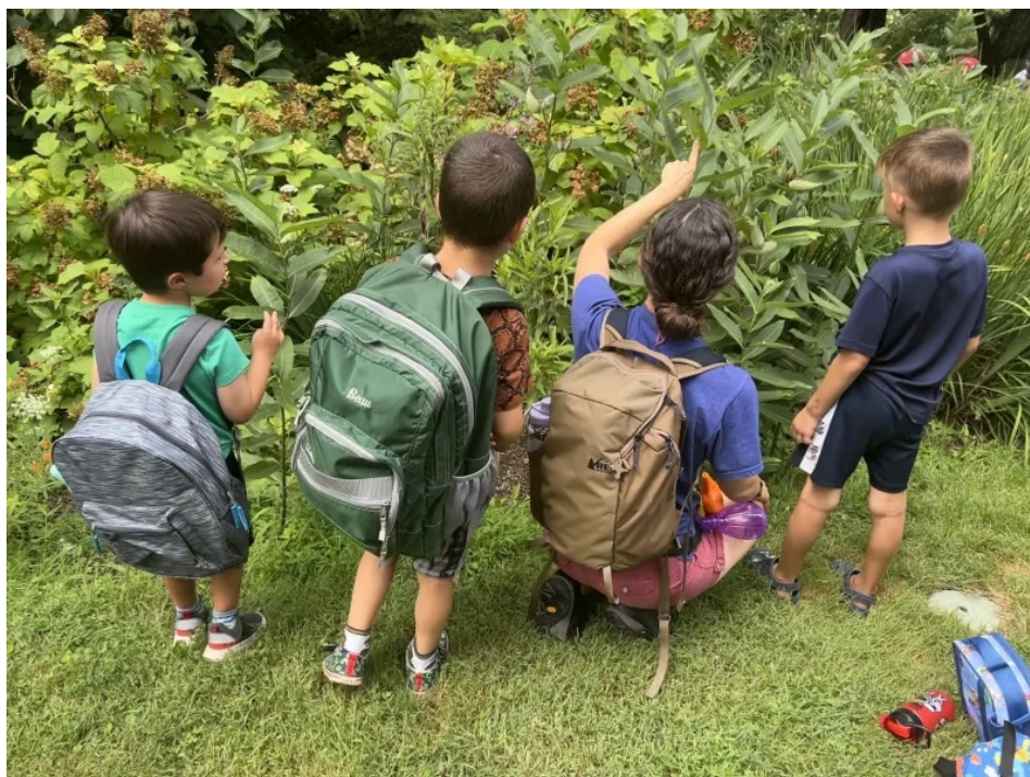
A variety of summer camps at the Morris Arboretum & Gardens offer children aged 4-10 the chance to explore plants, animals, and other fun aspects of nature.

community professionals in related fields. Register: https://hs.sas.upenn.edu/summer-programs/academies/asl .