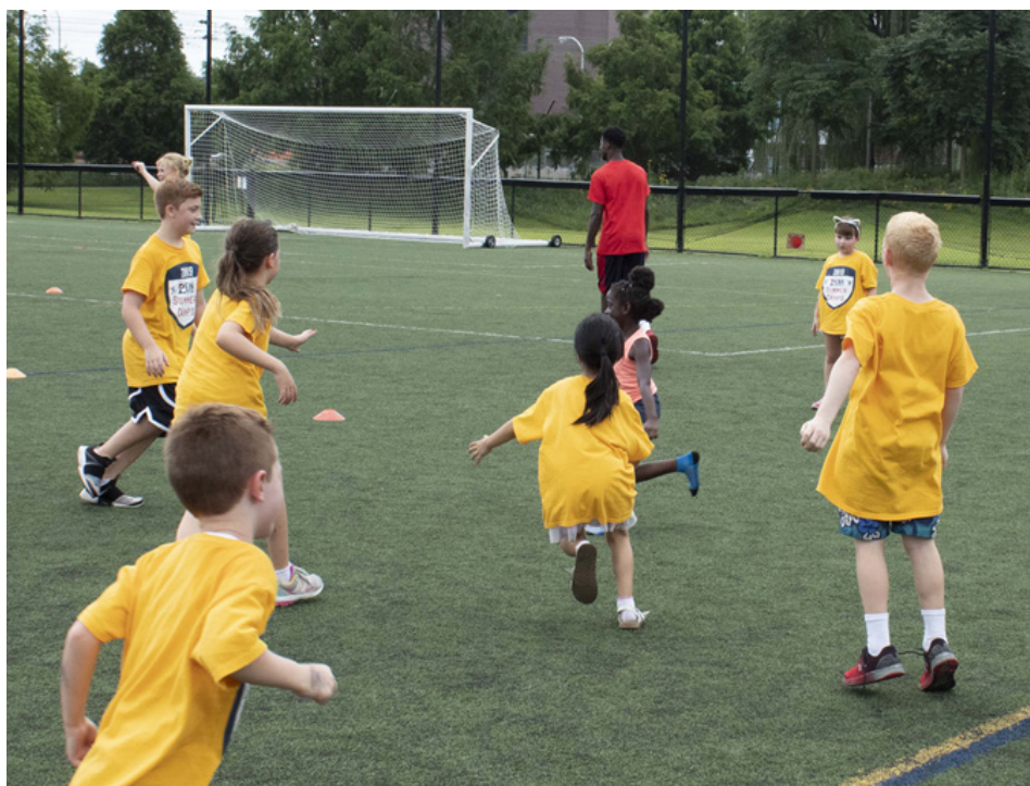
Penn's Campus Recreation Adventure Camp is one of many options available to athletically inclined children aged 6-12 this summer.

Youth Quaker Baseball Camp: Session 1: June 17-20. Session 2: June 24-27. Session 3: July 15-18. Session 4: August 5-8. This camp will focus on teaching all aspects of the game. It will provide an organized and structured camp on preparing the younger player for the next level and refining their game. Competitive and challenging drills will be performed in a fun and safe environment. Open to children aged 7-13. Fee: $300/week. Register: https://www.pennbaseballcamp.com/ .