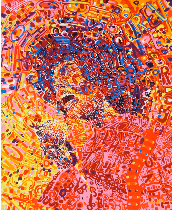
Wadsworth Jarrell, Revolutionary , 1972. Screenprint on paper. The Institute of Contemporary Art presents The Freedom Principle: Experiments in Art and Music, 1965 to Now . This exhibition links the vibrant legacy of avant-garde jazz and experimental music of the late 1960s (particularly within the African American arts scene on the South Side of Chicago) and its continuing influence on contemporary art and culture today. It will be on view from September 14 through March 19, 2017 . See Exhibits .