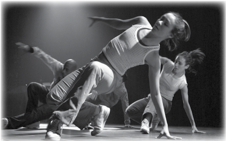
Above: See the world premiere of Rubberband Dance Group’s Phase II , a multimedia work that fuses hip hop and ballet, on November 6 at the Zellerbach Theatre, Annenberg Center. See On Stage.

After the Age of Oil; innovative ideas, projects, initiatives, and policies from around the world that seek to reduce emissions by changing the way we inhabit cities; Lower Gallery, Meyerson Hall; reception: November 7, 7:30 p.m. Through November 8.