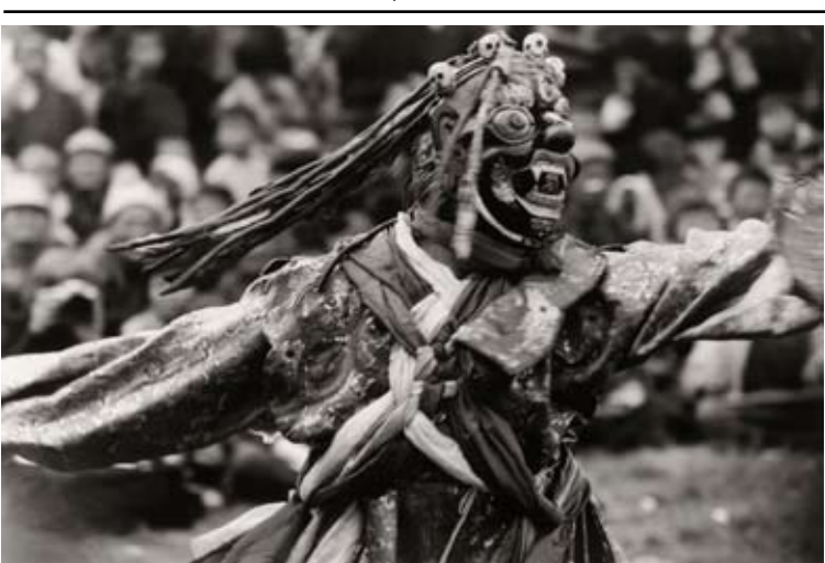
Above: Temple Dancer, Bhutan, 2003. Photograph by Andrea Baldeck, part of the photo exhibit, Himalaya: Land of the Snow Lion, now open at the Penn Museum through March 8. See Exhibits.

Wherever these symbols appear, more images or audio/video clips are available on our website, www.upenn.edu/almanac/.