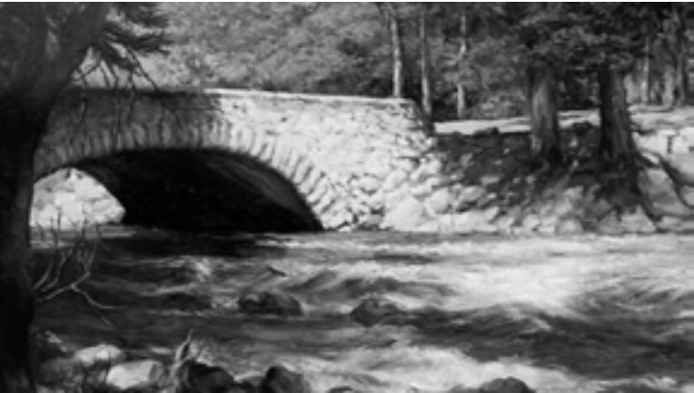
Left: Fairmount Park Bridge, a painting by Susan Schary, included in Coast to Coast at the Burrison Gallery through September 26, consisting of still-lives, landscapes and portraits painted in various parts of the country. See Exhibits.