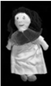
Left: Replica of a doll made in the 1940s by a Lenape woman for her granddaughter. On the back, a hidden face is meant to teach the young girl to keep her heritage a secret.