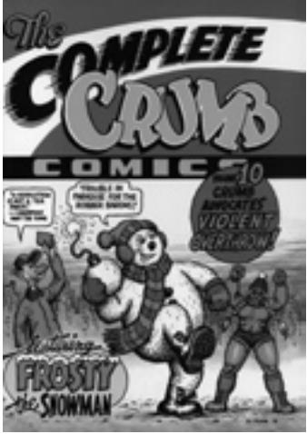
Above: Robert Crumb, Complete Crumb Comics #10, 18 7/8" h x 16 15/16" w x 1 1/8" d, framed; cover, 1991, ink on paper. Part of Underground: The Work of Cartoonist Robert Crumb at ICA. See Exhibits.