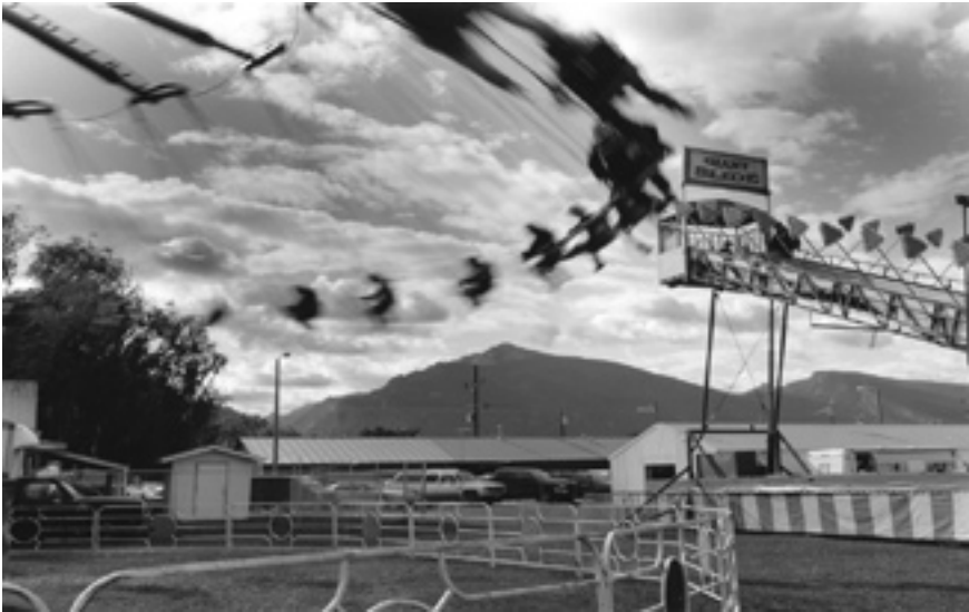
Above: Bitterroot Mountains and Ravalli County Fair, Hamilton, Montana. Part of "Lewis and Clark Revisited: A Trail in Modern Day" at the Penn Museum.