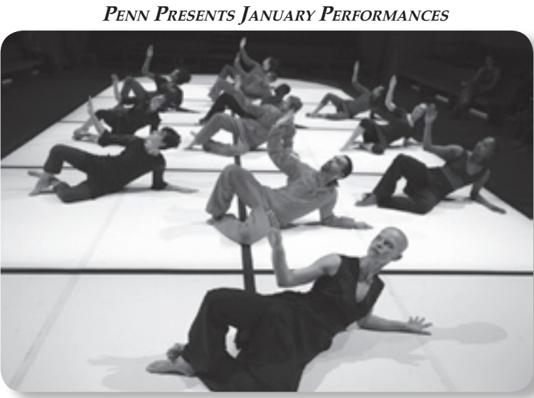
Above: Expect the unexpected when Bill T. Jones/Arnie Zane Dance Company takes the stage with the Philadelphia premiere of Chapel/Chapter! Jones, who recently won a Tony Award for best choreography for the Broadway hit, Spring Awakening, has been at the vanguard of experimentation for the past 20 years. He always has something important to say and he does so with dramatic force, uncompromising honesty, piercing intensity and great artistry. His newest tour-de-force, the evening-length multi-media Chapel/Chapter, explores the sacred and the vernacular. Built on three provocative stories exploring the underbelly of the court and prison systems with text both spoken and sung live, the production is set to a score of madrigals, folksong and plainsong. January 29 & 30, Annenberg Center. See On Stage.