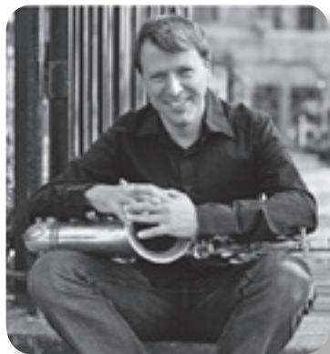
Left: Jazz saxophonist, composer, multi-instrumentalist, Chris Potter has released albums as leader and has performed/recorded with noted musicians including Kenny Werner, Marian McPartland, the Mingus Big Band, James Moody, Joe Lovano, Steely Dan, and many more.