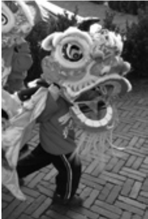
The Lion Dance grand finale performed by Cheng Hung Gar Kung Fu Academy lion dancers and drummers.