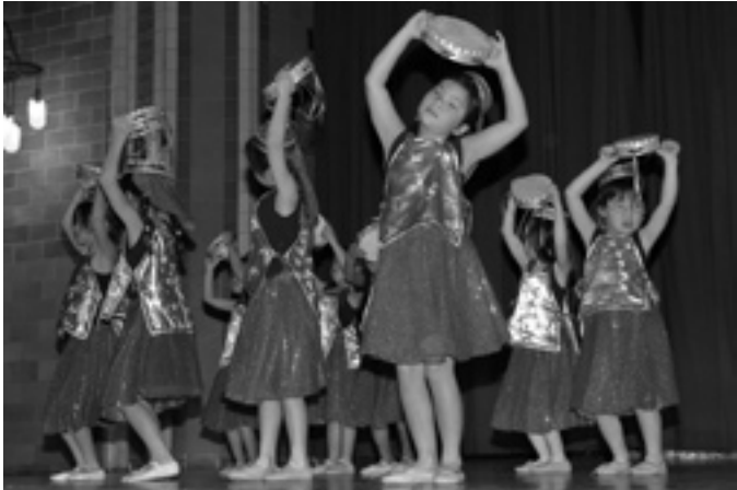
Left: Young performers from the Mei-Mei Dance Company. The dance group performs each year at the Penn Museum's Chinese New Year Celebration, as does the Jade River Dance Company, the University of Pennsylvania's Pan-Asian Dance Troupe and the Plum Flower Dance, all with dancers of varying ages and styles.