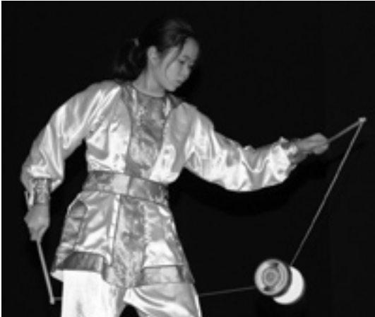
Boys and girls of the Jade River Dancers demonstrate their skills and dexterity with the Giant Chinese yo-yo, also called a diabolos, at the annual Chinese New Year Celebration.