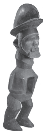
Above, Teke male figure from the Democratic Republic of the Congo.