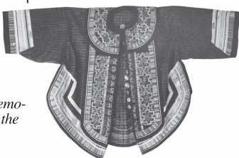
Above, a women's ceremonial jacket from China, 1820.

Treasures...From the Silk Road to the Sana Fe Trail is a new annual Show and Sale of exceptional fine art, antiques, carpets and textiles from Asia, Africa, Oceania and the Americas. More than 50 distinguished dealers from the U.S. and abroad will offer a wide selection of vetted 18th, 19th and 20th century works of art. The opening preview is on October 27 from 4-9 p.m., followed by a three-day public run, October 28-30. This event is presented by The Women's Committee to benefit the Penn Museum. See Special Events . Here is a sampling of some of the pieces.