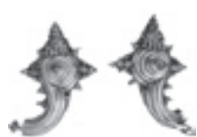
Above, gold earrings from Java, Indonesia. Below, a Japanese scroll painting from 1862 by Ueda Kochu entitled The Jade Dragon .

Treasures...From the Silk Road to the Sana Fe Trail is a new annual Show and Sale of exceptional fine art, antiques, carpets and textiles from Asia, Africa, Oceania and the Americas. More than 50 distinguished dealers from the U.S. and abroad will offer a wide selection of vetted 18th, 19th and 20th century works of art. The opening preview is on October 27 from 4-9 p.m., followed by a three-day public run, October 28-30. This event is presented by The Women's Committee to benefit the Penn Museum. See Special Events . Here is a sampling of some of the pieces.