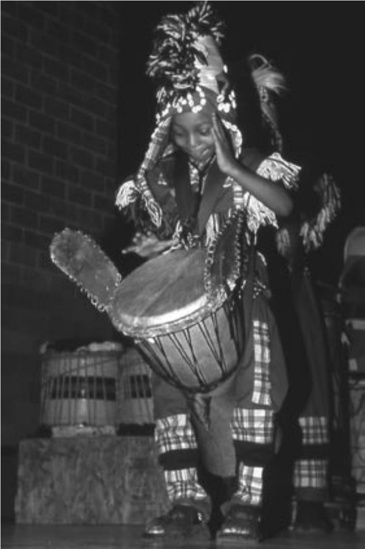
A young drummer from the Universal African Dance & Drum Ensemble will perform at UPM's 15th Annual Celebration of African Cultures extravaganza on February 21. See Special Events.

20 Trustees Stated Meeting ; time and location TBA. 25 University Council ; 4-6 p.m.; Bodek Lounge, Houston Hall.