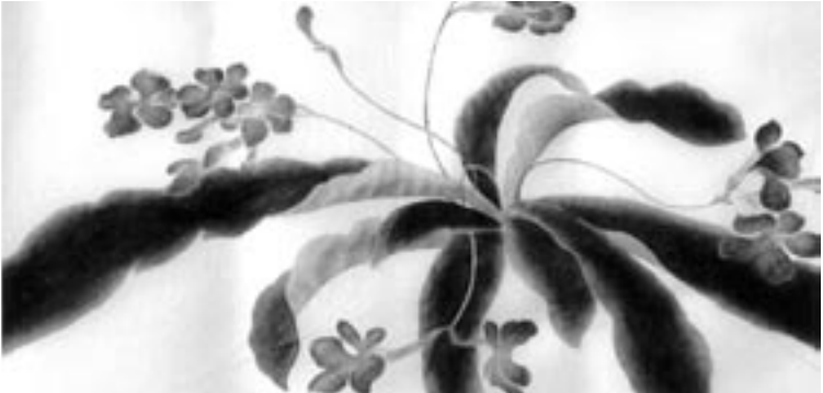
The Burrison Gallery presents A Look at Nature: Flowers & Landscapes, an exhibit that features watercolors with classic Chinese brushstrokes by artist Deena Gu. Above, a watercolor on silk entitled Blue Flower, 17" x 11.5". This exhibit is on display through March 13. See Exhibits.