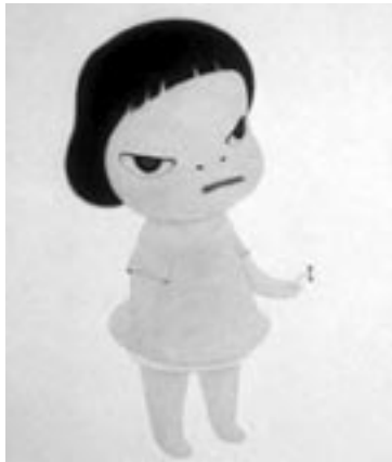
Simultaneously "cute and menacing," such images of young children and childhood pets are part of the exhibit, Yoshitomo Nara: Nothing Ever Happens , one of the ICA's Winter 2004 Exhibitions, which runs December 24 through April 4.

Wrestling vs. Cornell ; 1 p.m. (W) Basketball vs. Brown ; 7 p.m. (M) Squash vs. Haverford, Franklin and Marshall, Penn State and GWU Rochester ; all day.