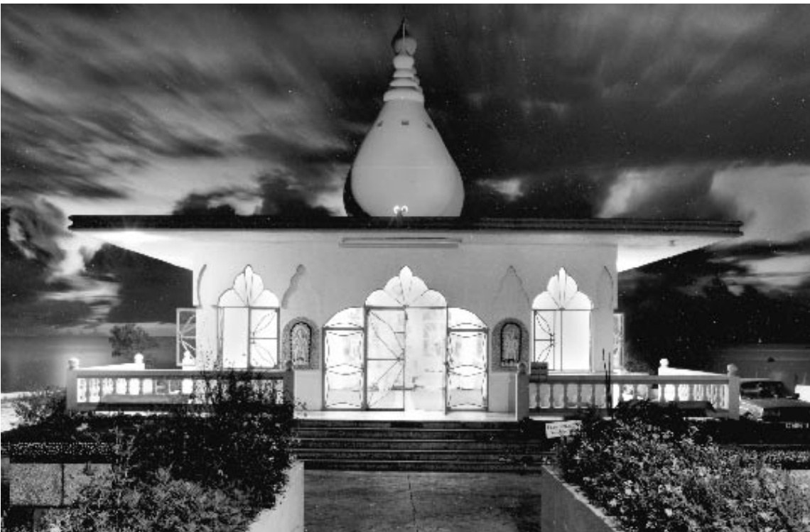
Hindu Temple in the Sea is a photograph taken by artist Wyatt Gallery of a temple in Waterloo, Trinidad. This work is part of an Arthur Ross Gallery exhibit entitled Viewpoints: Nine Faculty Photographers. The exhibit features works by artists who reflect current developments in the art of photography, and the recent growth in the Fine Arts department. See Exhibits.