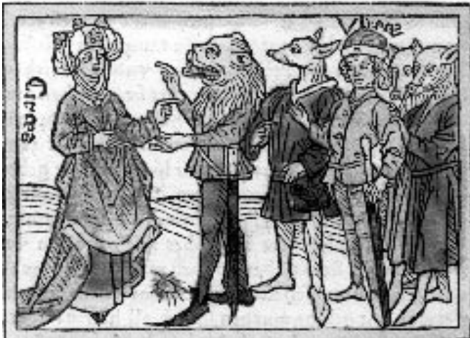
Literary work, De claris mulieribus , by Giovanni Boccaccio (written between 1360-1374) can be seen in the Penn Library exhibit Literae Humaniores at the Katholieke Universiteit Leuven in Belgium through October 15.