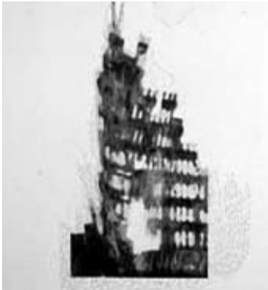
South Tower, The Gems of Tragedy , 2002, Patti Smith, graphite, crayon, tape, and digital image on paper, 13 3/8" x 11".