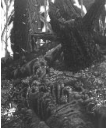
Earthly Delights, Julie Cardillo, 2003, oil on canvas, 32 x 40". Part of the Nature's Unseen Narrative exhibit in Burrison Gallery.

See Exhibits on the other side to find specifics about all the exhibits around campus, those currently on display and those soon to be on view.