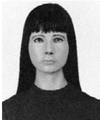
Self Portrait , Gillian Wearing, 2000, chromogenic development print, 67 3/4" x 67 3/4".