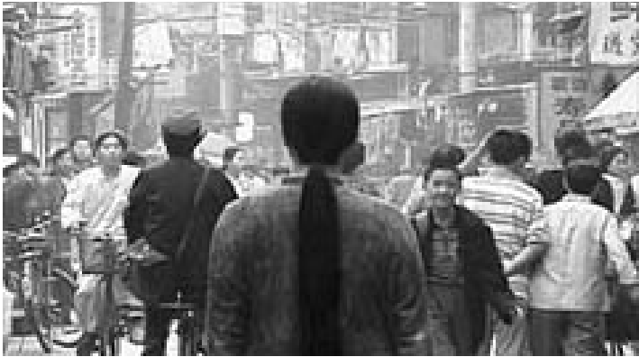
A Needle Woman , Kim Sooja, 1999-2000, Color DVD installation, 98" x 139", Courtesy of the artist.