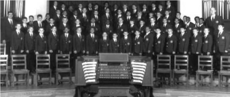
The Keystone Boychoir has performed for Gov. Ed Rendell and Nelson Mandela, and in such countries as Brazil and South Africa. They will perform at the Morris Arboretum on Sunday afternoon, September 28. See Music.

Biology in the Movies film series. Showings at 7 p.m. in the Grossman Auditorium, Wistar Institute.