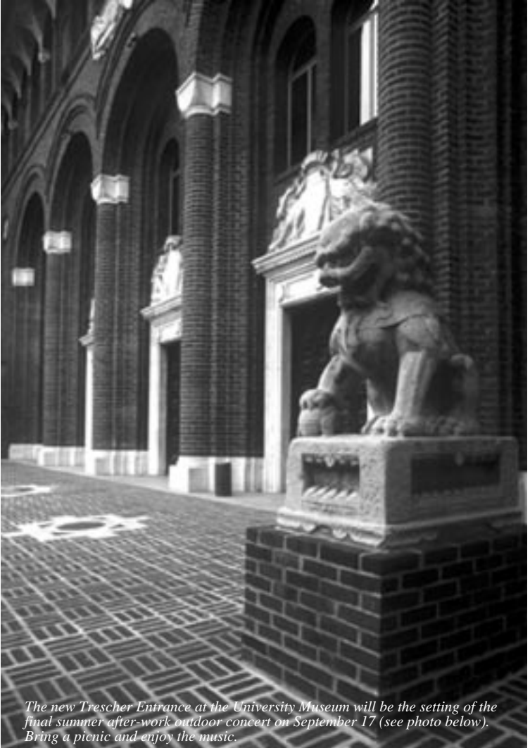
The new Trescher Entrance at the University Museum will be the setting of the final summer after-work outdoor concert on September 17 (see photo below). Bring a picnic and enjoy the music.

Whenever there is more than meets the eye, see our web site, www.upenn.edu/almanac/.