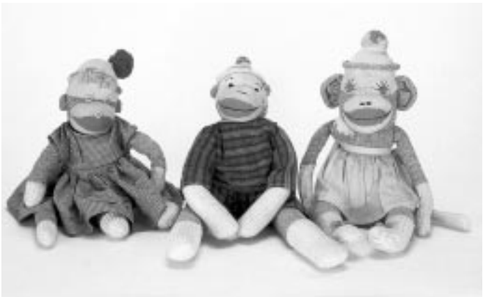
Sock Monkeys from a private collection

Office of Learning Resources Info: (215) 573-9235. all workshops in Houston Hall. 5 10 Best Study Strategies ; 4-5 p.m. & 7-8 p.m.; Golkin Room. 9 Introduction to Time Management ; 7-8 p.m. Griski Room. Also September 17, 7-8 p.m. Griski Room. 23 Reading Versatility ; 7-8 p.m. Griski Room. Also October 1, 7-8 p.m. ; Bishop White Room.