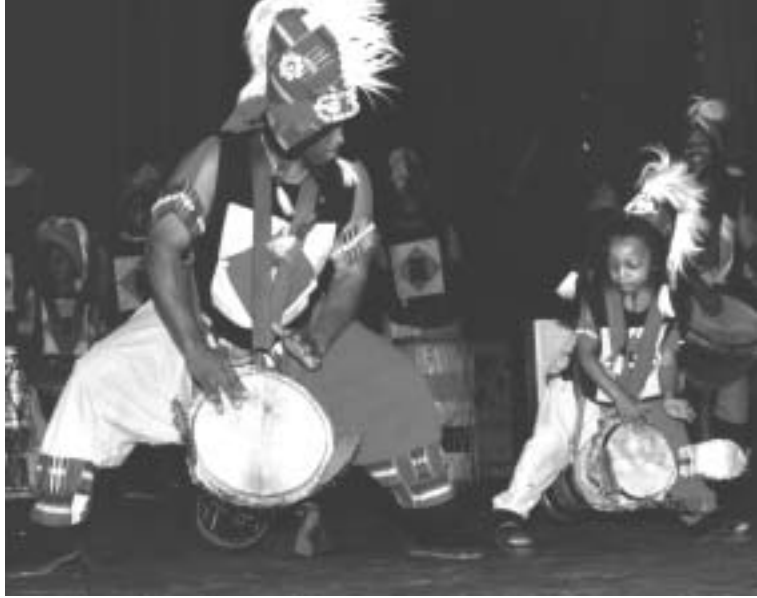
The Universal African Dance & Drum Ensemble, more than 30 members strong, will be among the many performers at UPM’s 14th annual Celebration of African Cultures extravaganza on February 15. See Children’s Events .

MEETINGS 5 WXPN Policy Board; noon; 1650 Arch St. 14 PPSA Executive Board; noon; Annenberg Conference Room. Also February 28. 21 Board of Trustees; Stated Meeting.