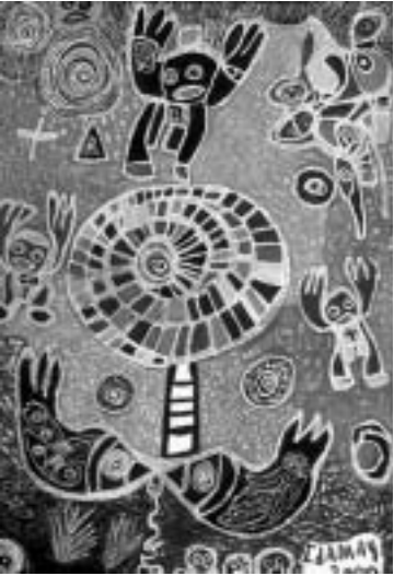
Vision by Ida May Sydnor, 2000, is one of the many works in the exhibit Art & Community II: Art of the Southwest Community Enrichment Center on display at Esther Klein Gallery. See Exhibits .

SPORTS 1 (M) Basketball vs. Harvard; 7 p.m. 7 (W) Basketball vs. Cornell; 7 p.m. 8 (M) Squash vs. Harvard; 11 a.m. (W) Squash vs. Harvard; noon. Wrestling vs. Harvard; 2 p.m. (W) Basketball vs. Columbia; 7 p.m. 9 (M) Squash vs. Dartmouth; 11 a.m. (W) Squash vs. Dartmouth; 11 a.m. Wrestling vs. Brown; 1 p.m. Wrestling vs. Hofstra; 3 p.m. Wrestling vs. Rider; 5 p.m. 11 (M) Basketball vs. Princeton; 8 p.m. 14 (M) Basketball vs. Yale; 7 p.m. 15 (W) Tennis vs. VCU; noon. (M) Lacrosse vs. Towson; 1 p.m. (M) Swimming vs. Harvard; 1 p.m. (W) Tennis vs. Binghamton; 4 p.m. (M) Basketball vs. Brown; 7 p.m. (W) Tennis vs. Old Dominion; 3 p.m. 16 (W) Basketball vs. Harvard; 7 p.m. 21 Wrestling vs. Princeton; 2 p.m. (W) Basketball vs. Dartmouth; 7 p.m. 25 (W) Tennis vs. Seton Hall; 3 p.m. 28 (W) Basketball vs. Brown; 7 p.m.