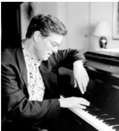
Peter Serkin, a renowned classical pianist, will perform March 22 at Irvine Auditorium. Rush tickets ($39; $29; $19) for faculty and staff, are available at the Annenberg Center Box Office (215) 898-3900.