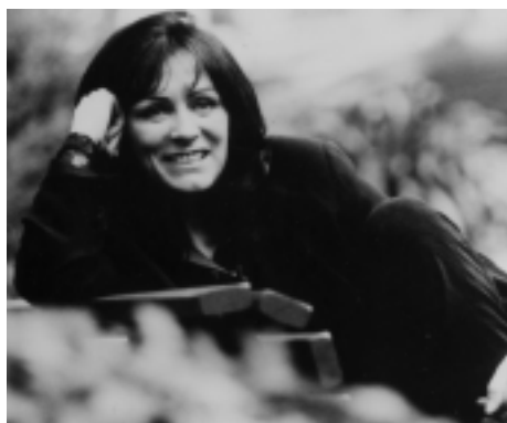
A legend in her homeland of Ireland, Mary Black has long held the attention of the followers of Irish music as one of the finest pop music vocalists in the world. She will perform on stage at Annenberg Center's Zellerbach Theatre on February 24 at 7 p.m.