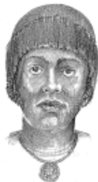
Sketch of suspect as described at left