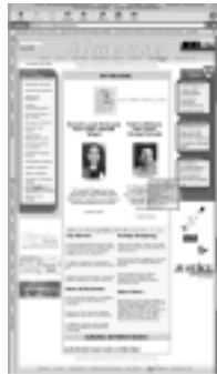
The Almanac then, . . . Almanac online now.