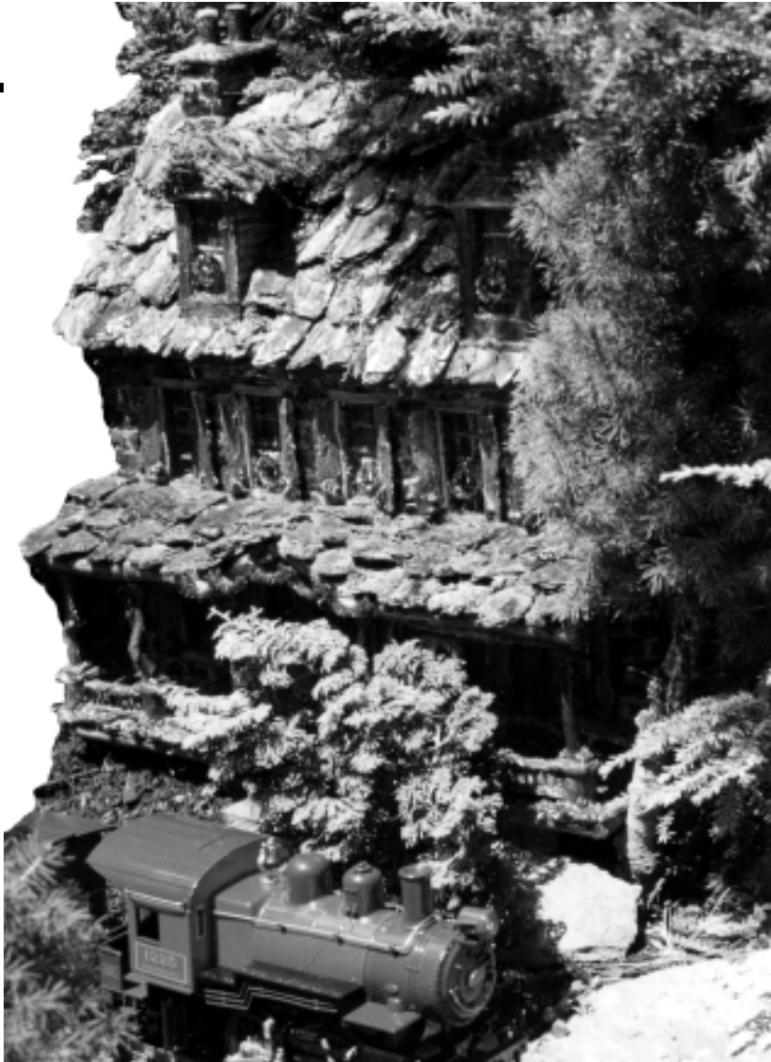
A seasonal model of historic Mill Grove, the first home of John James Audubon, Pa. is part of the Morris Arboretum's Holiday Garden Railway display. See Exhibits.