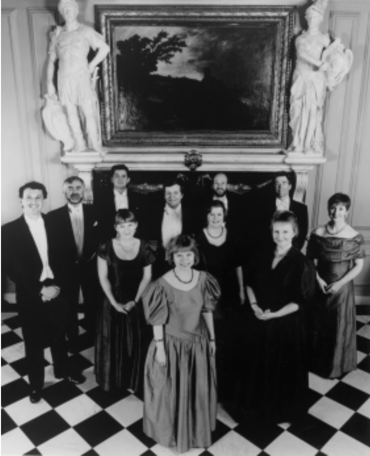
The Tallis Scholars sing seasonal favorites on December 9. See Music, reverse.